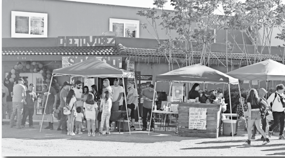
A plethora of vendors drew the crowds to the Cheetovibez four-year anniversary celebration.