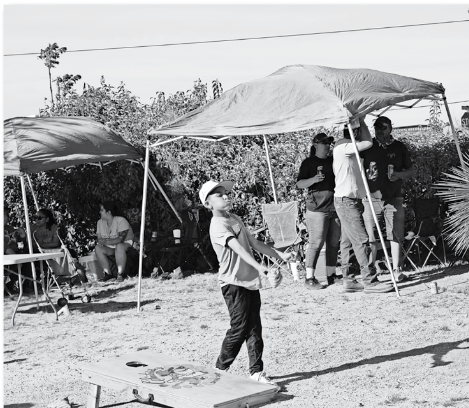
A participant in the Cheetovibez anniversary cornhole tournament.