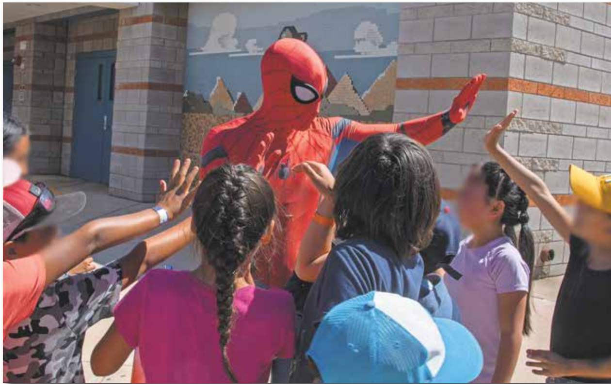
Spiderman giving high fives to everyone.