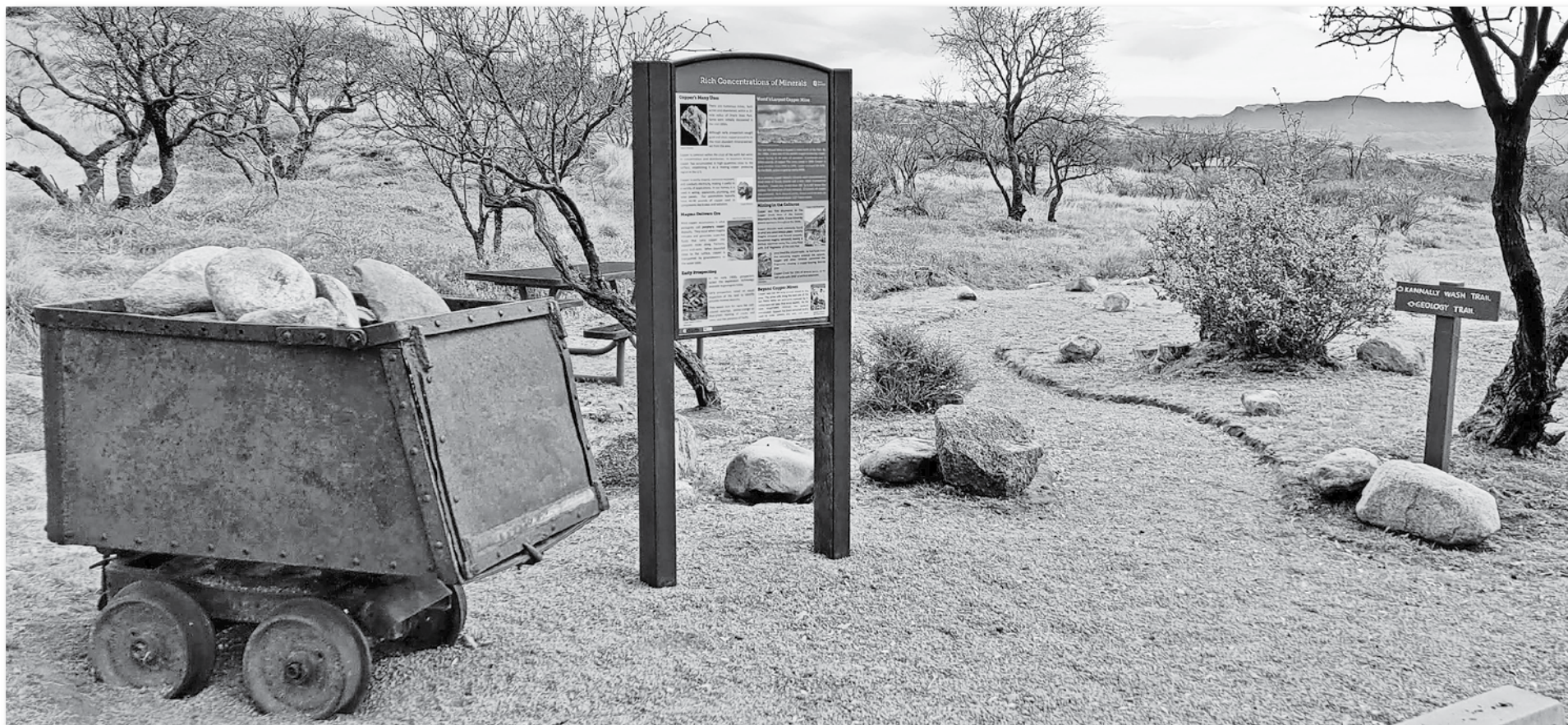
One of the new trailheads for the Oracle State Park Geology Trail – this one has one of the new geology interpretive signs next to an ore cart from the 1940s.