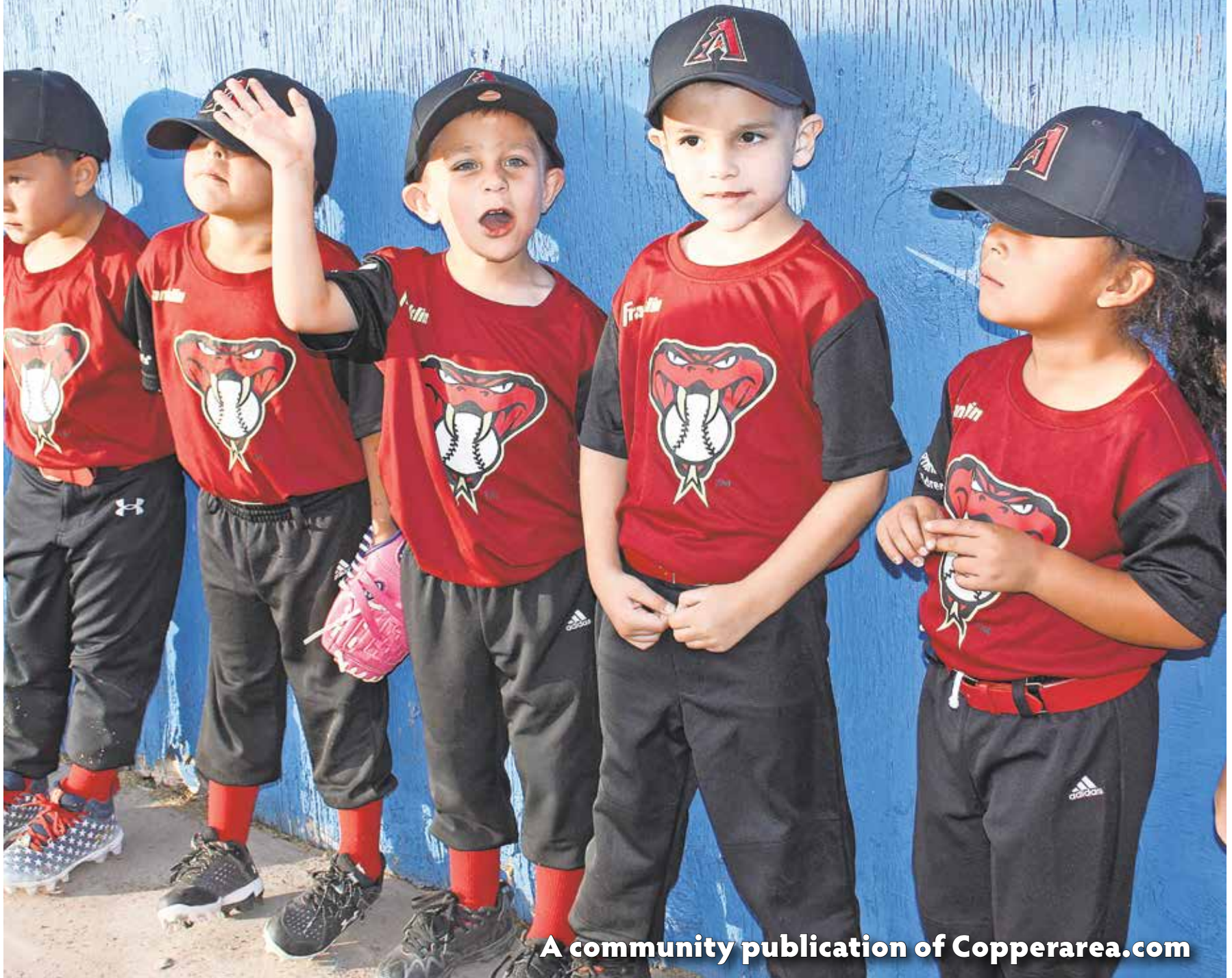
James Carnes | Copper Basin News