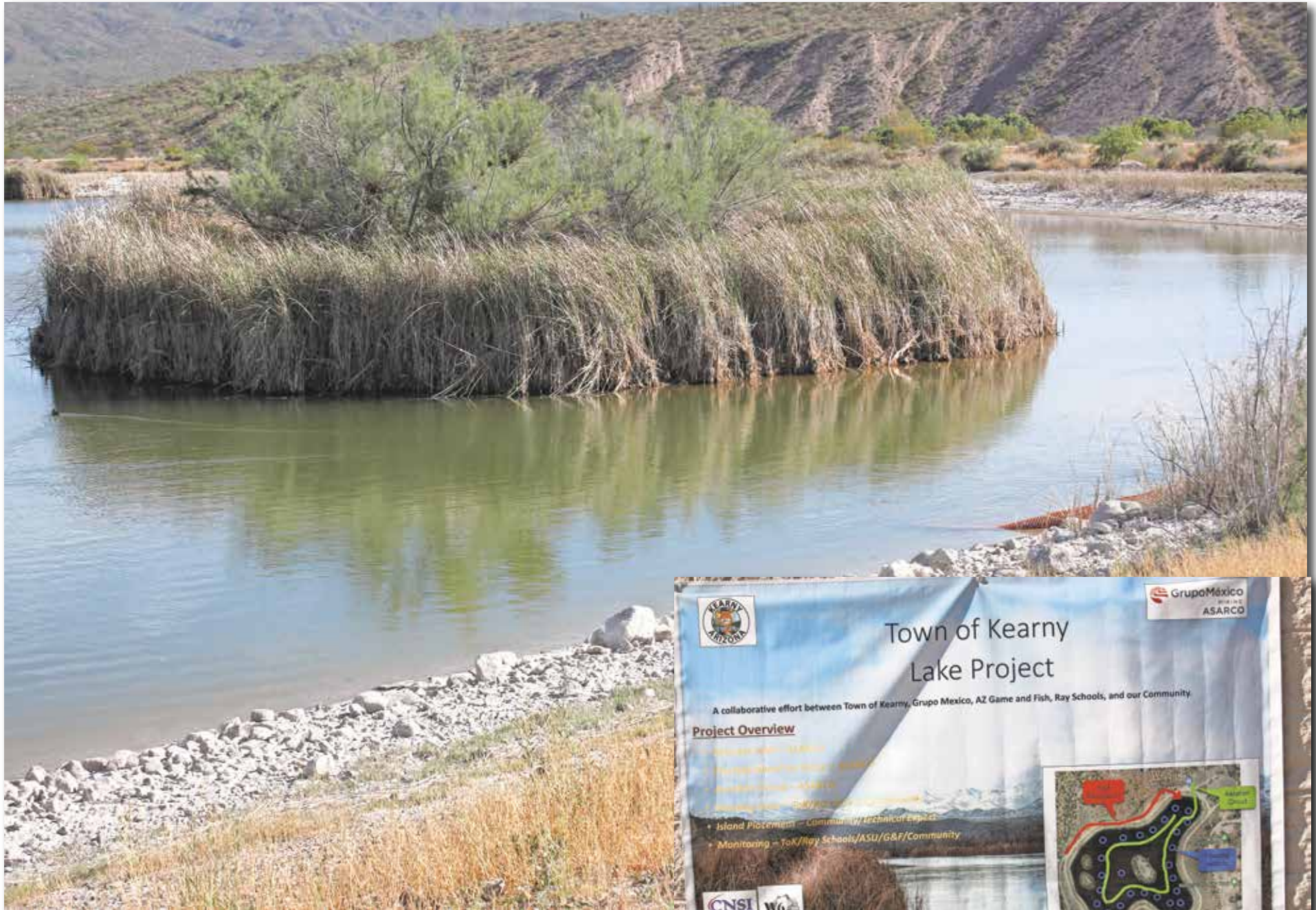
The water levels are coming down at the Kearny Lake due to the amount of water drained recently.