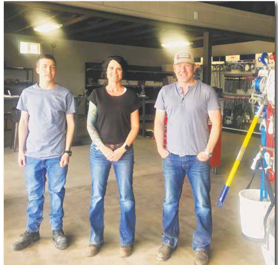
The crew from Atlas Mining & Manufacturing Co.