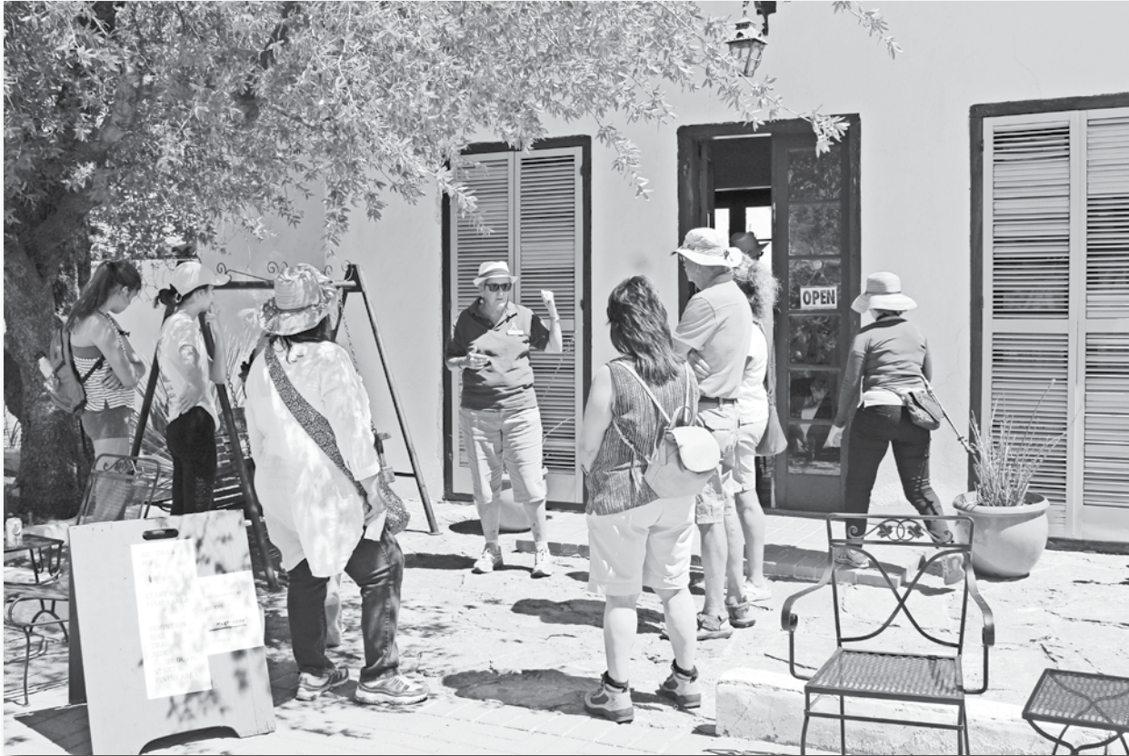
The Friends of the Oracle State Park hosted an Earth Day celebration. Informational booths, food trucks and hikers on the Arizona Trail were on hand to celebrate.