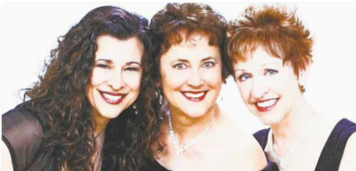
Nota Bene will perform Sunday in Oracle.

Don't miss the opportunity to see this lively trio at Oracle Center for the Arts, Sunday, April 28, at 4 pm. Tickets are $20 at the door or may be purchased in advance on www.oraclepianosociety.org . The Oracle Center for the Arts is located at 700 E. Kingston St., Oracle.