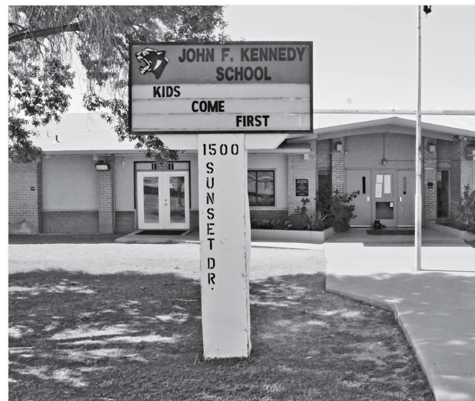
Kids come first at JFK Elementary.

ADE defines a safe school as one that is free from violent and criminal behaviors and allows staff, students and community members to feel connected to the school and able to participate in its major functions – teaching and learning. Violent or criminal behaviors at school compromise the learning environment and put health and safety in jeopardy.