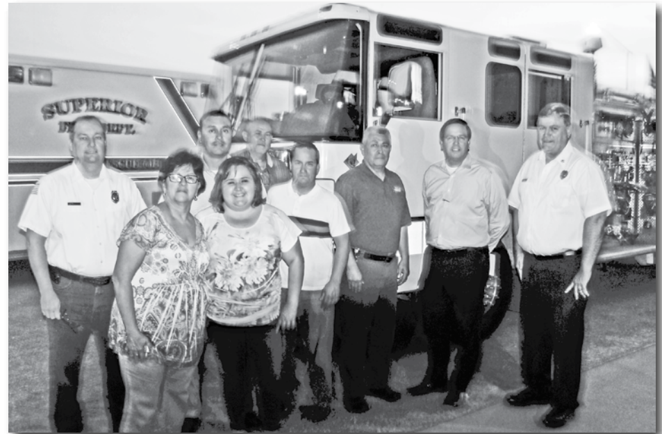
The Superior Town Council accepted the donation of a firetruck from the City of Mesa.