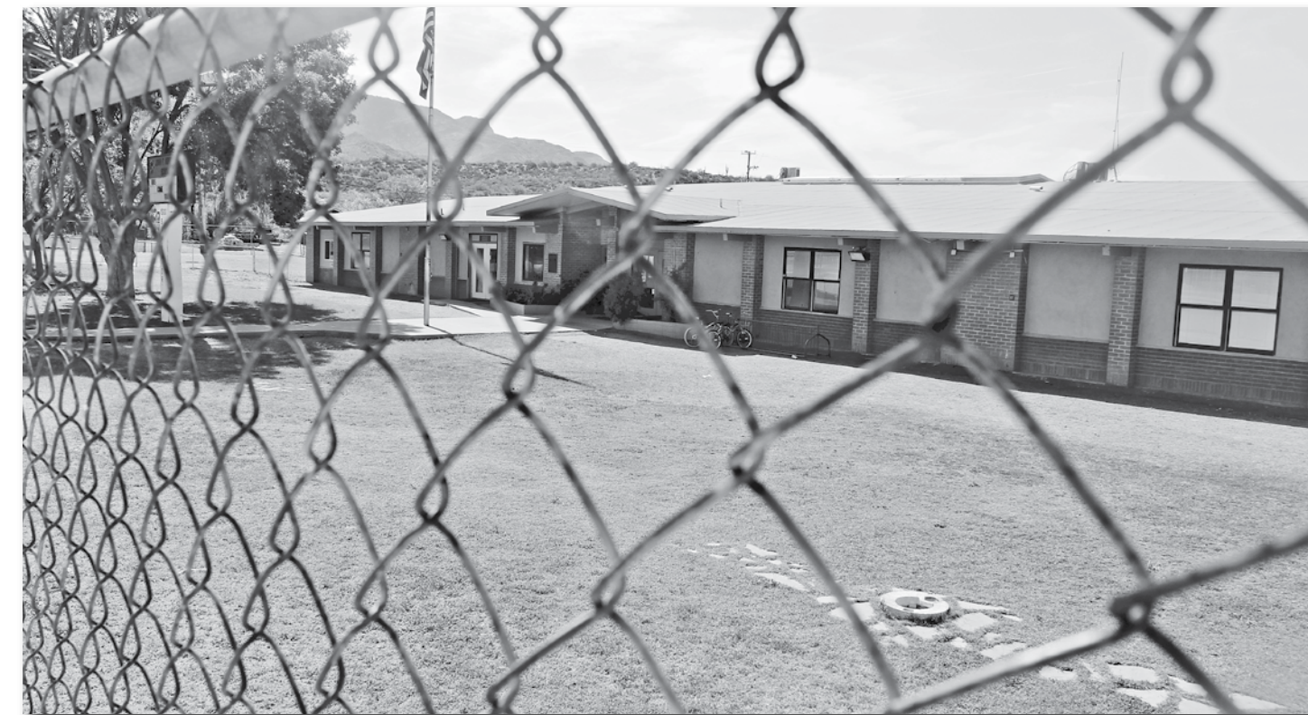
JFK School will soon get an upgrade to its security system thanks to a recent grant award.