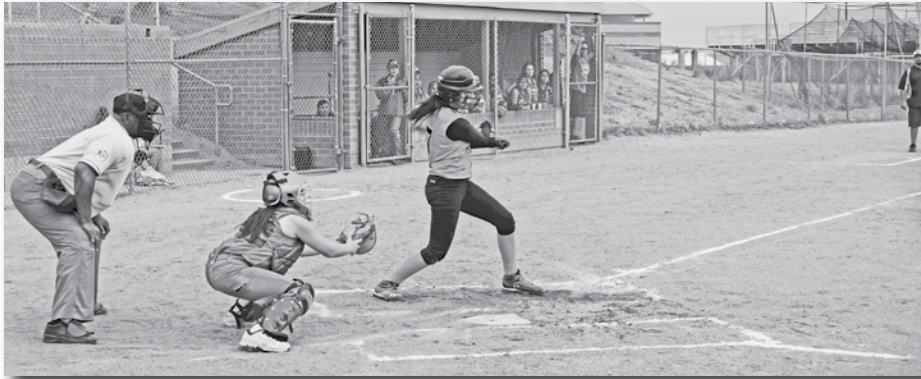
Lady Panther at the plate.

Check with the school for game times and location for the doubleheader against GCA.