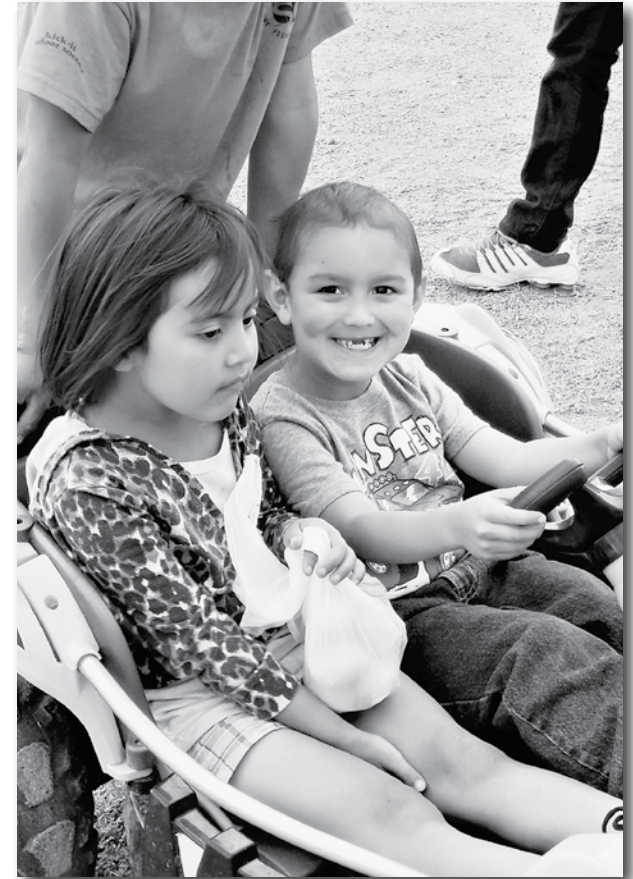
After the hunt in Mammoth.