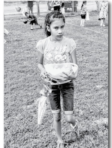
After the hunt in Mammoth.