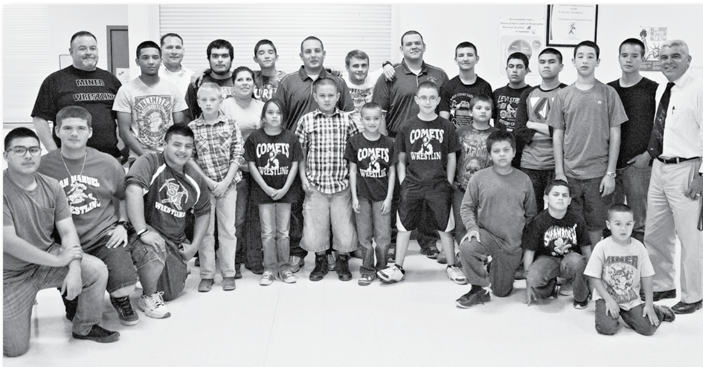
SM Wrestling - Past, Present and Future.