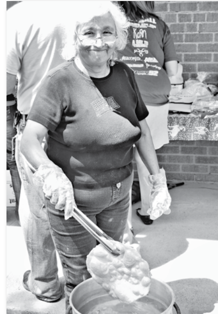
Indian fry bread at the Easter Blast.