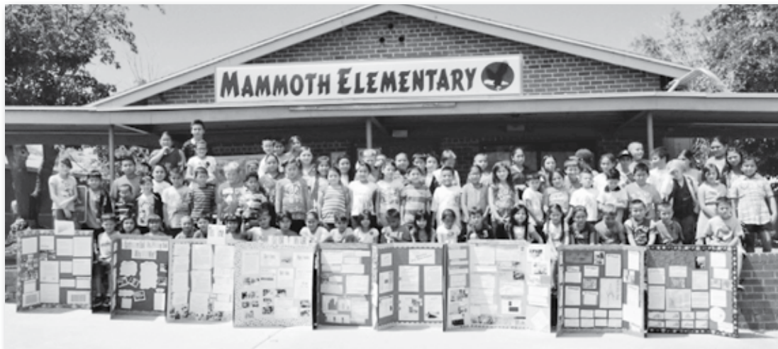
Students and teachers at Mammoth STEM show off their impressive array of projects.