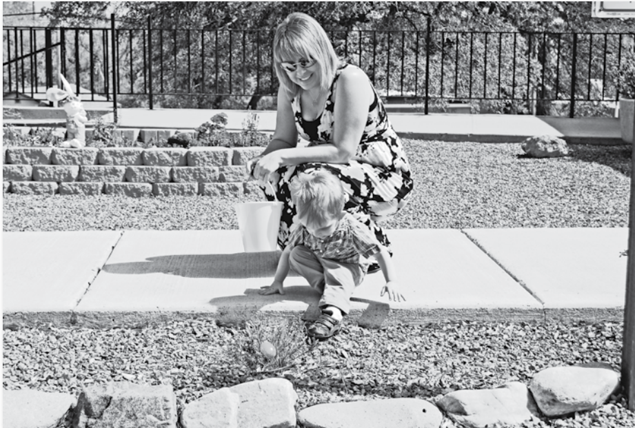
Decorating and egg searching at the Oracle Union Church.