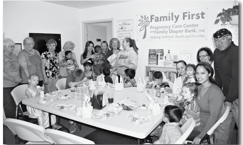
Family First volunteers and participants enjoy lunch after an egg coloring session.