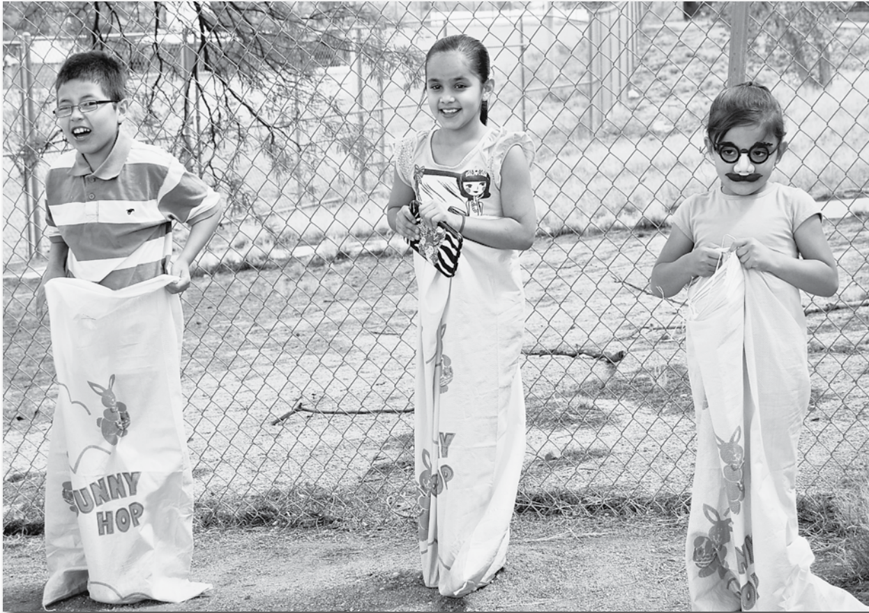
Hopping like bunnies at the AJC Easter Blast.