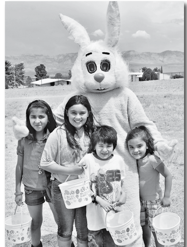
The Bunny of the hour – E.B. himself!