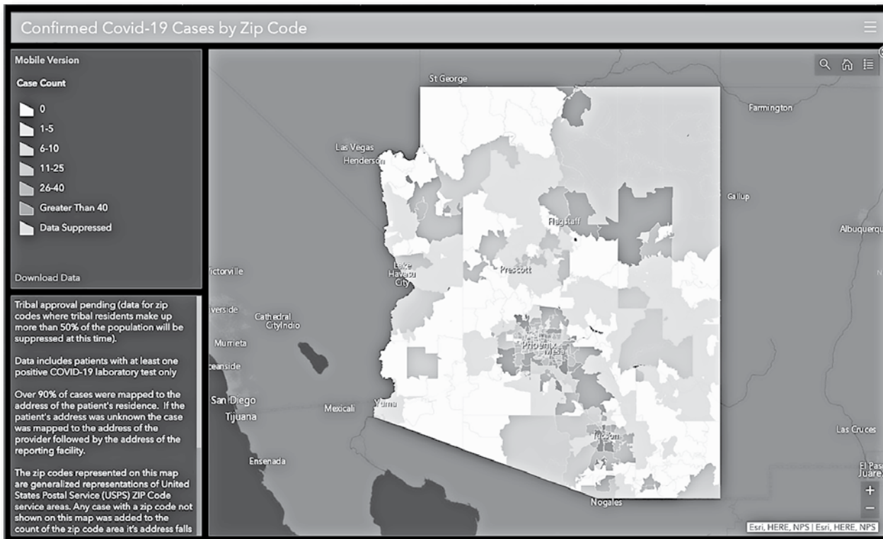
COVID-19 positive cases are now listed by zip code thanks to a new banner on the Arizona Department of Health Services website. Several cases have been confirmed in the Copper Corridor.

This data should be a reminder that the precautions everyone is taking, is working to help flatten the curve and stopping the spread of COVID-19.