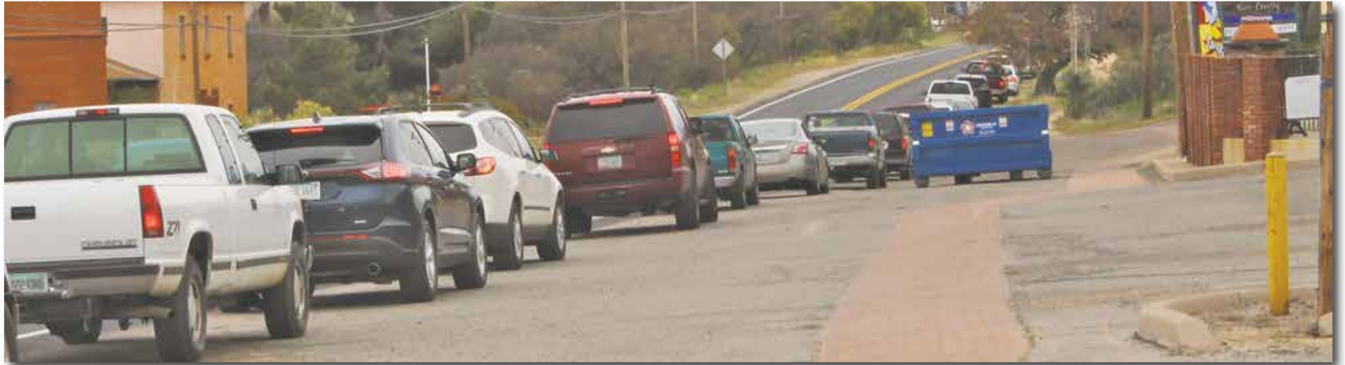
The first produce distribution in the Tri-Community causes a rare traffic jam in Oracle. The next distribution will be handled differently.