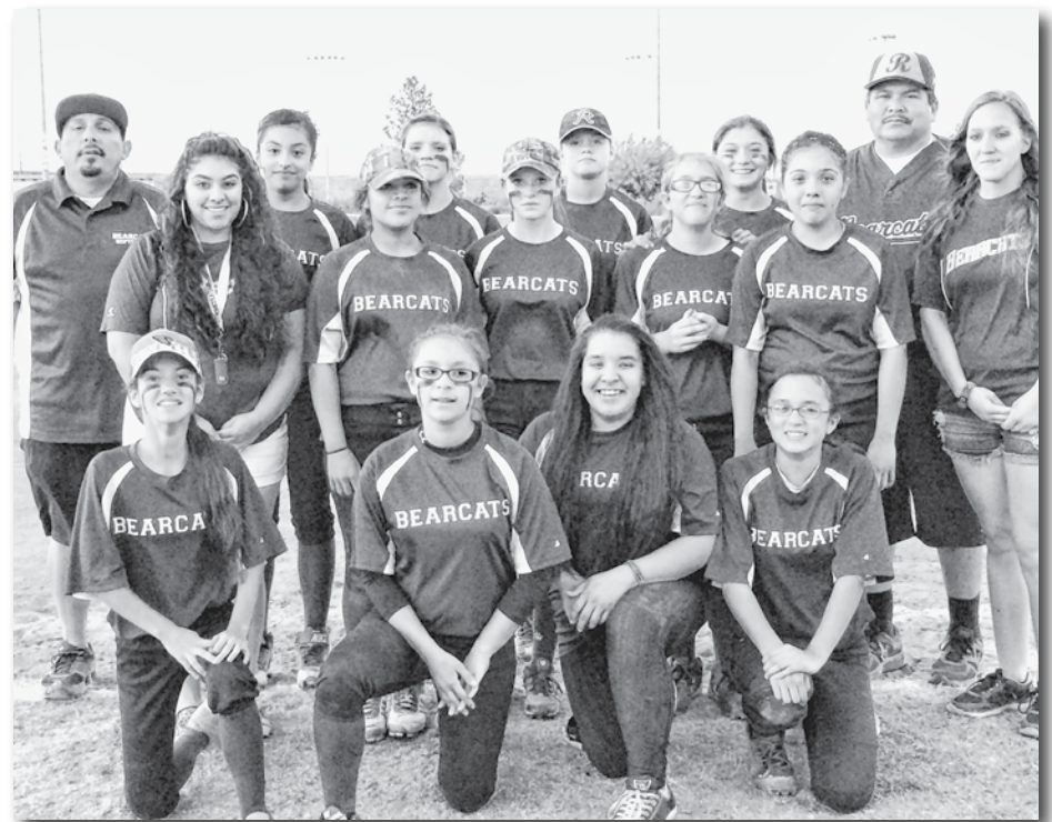
RJHS Lady Cats are undefeated. Up next are the playoffs.

Congratulations to the RJH softball team in finishing the regular season undefeated, scoring 15.5 runs/game as a team and allowing 3.1 runs/game as a defense. This Saturday the RJH softball team will travel to Eloy as the number one seed for the Central League Championships.