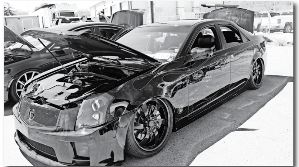
Best Paint, black/burgundy 2004 Cadillac CTSV – Brandon Stout (Oracle)