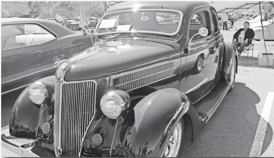
Best Car in Show, red 1936 Ford Wind Coupe – Bob Bradshaw