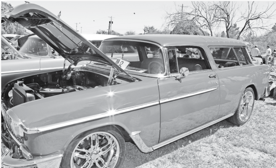
Best Interior, red 1955 Chevy Nomad – Denny Surface