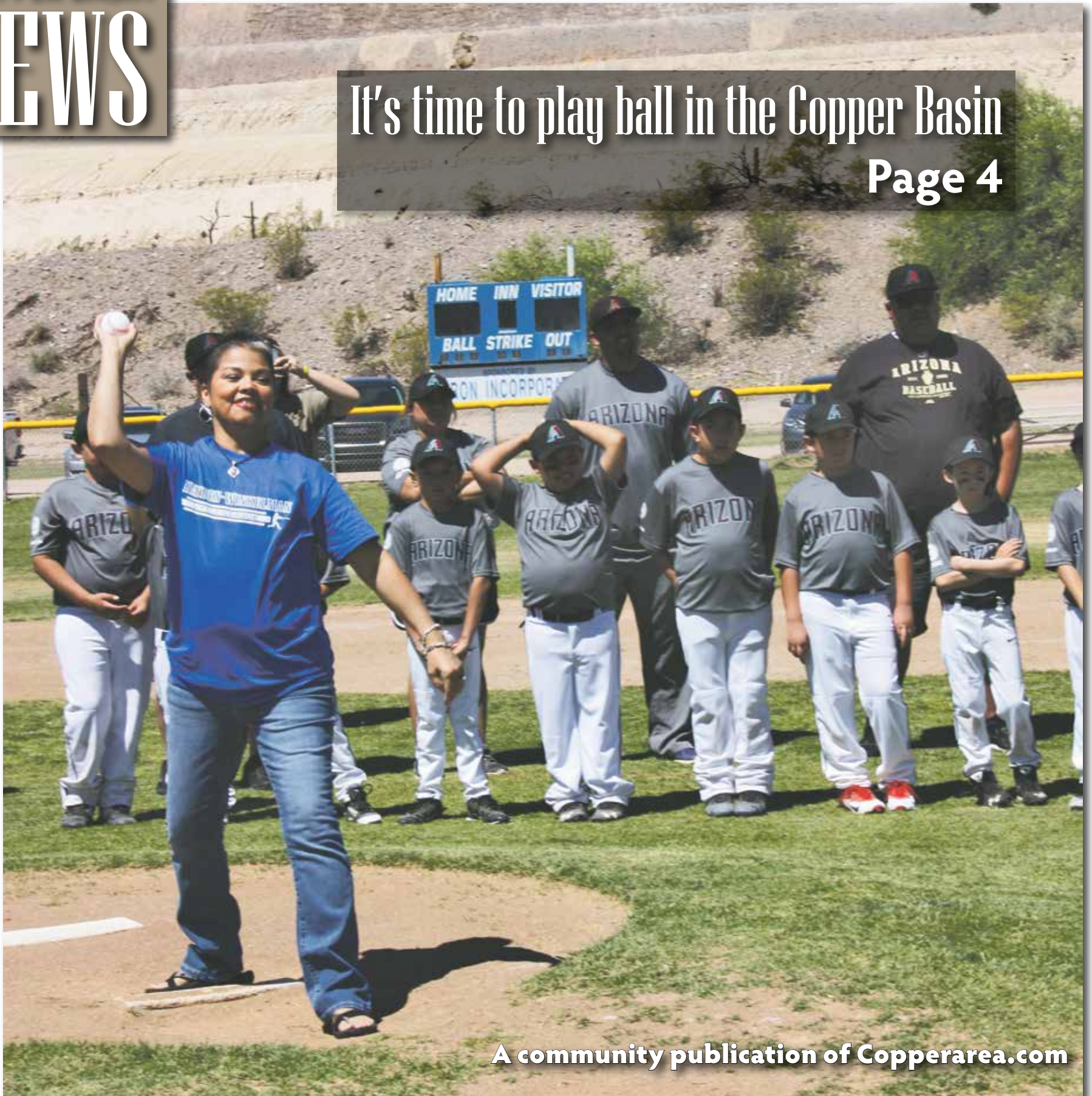
James Carnes | Copper Basin News