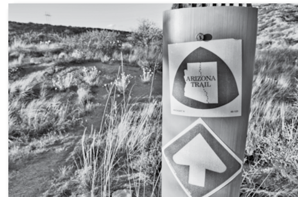
A sign on the Arizona Trail near Oracle.