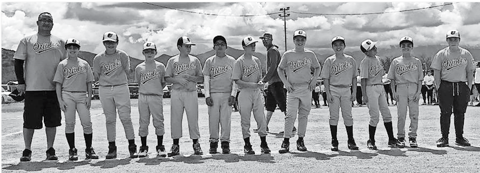
San Manuel Orioles