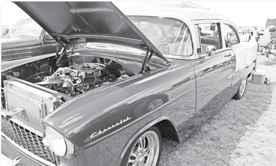
Best Engine, Silver/Burgundy 1955 Chevy S10 - Scott Beach (Tucson)