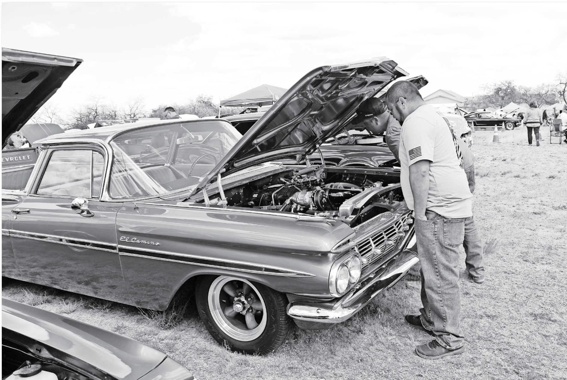
Gorgeous day and great location for the Oracle Spring Run Car Show. This year's temporary location was behind the Living Word Chapel in Oracle.