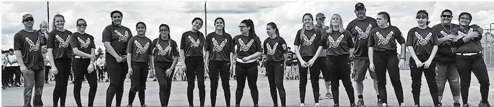
Oracle Softball Heavy Hitters