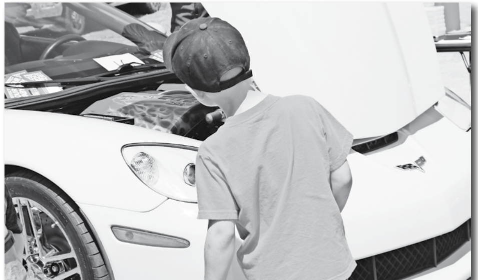
Checking out the cars.