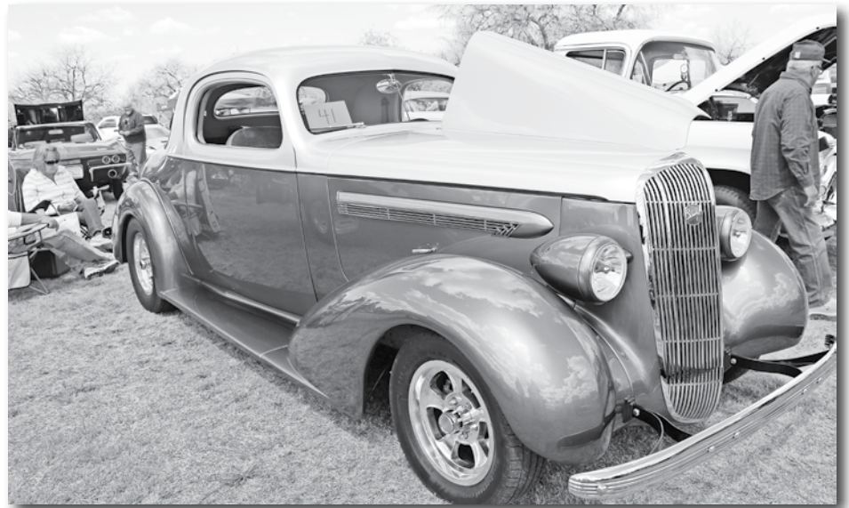
Best Car in Show, Silver/Purple 1936 Buick Coupe - Patricia Dudzic (Tucson)