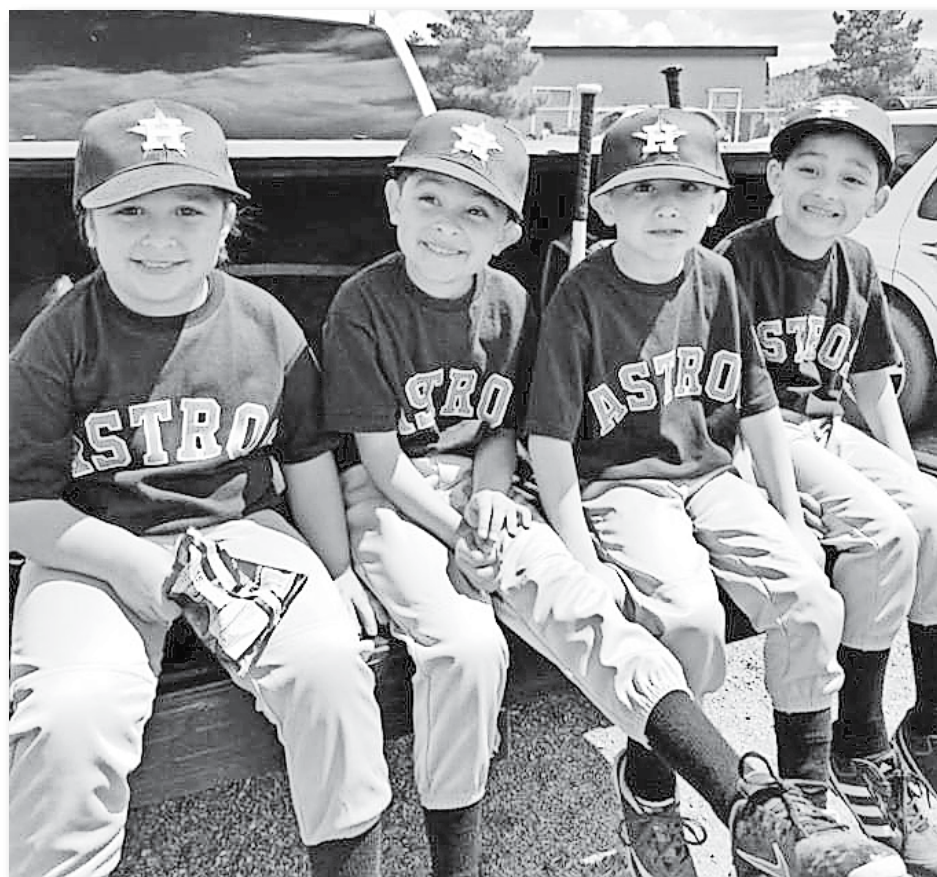
Teammates hanging out.