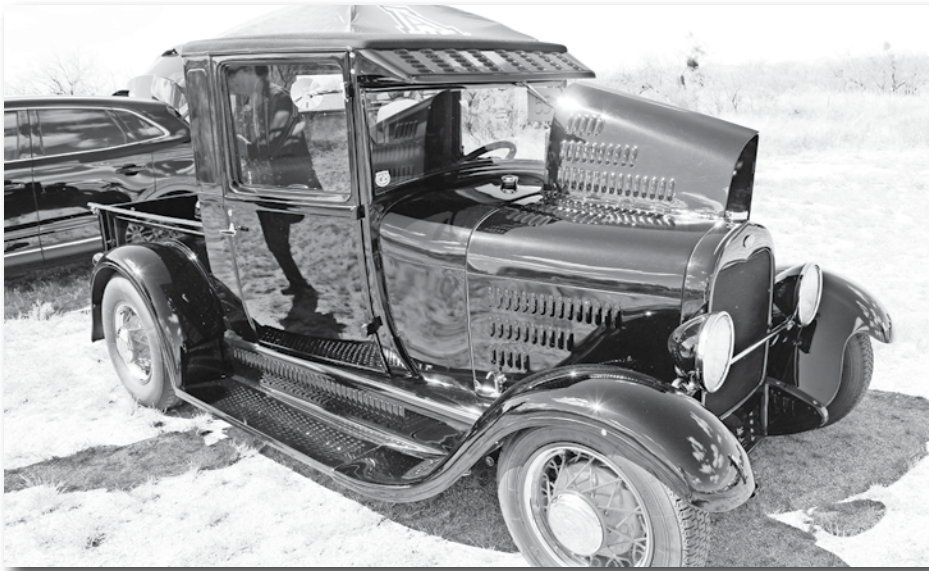
Best Truck in Show, Black 1928 Model A Truck - Don McDowell (Tucson)