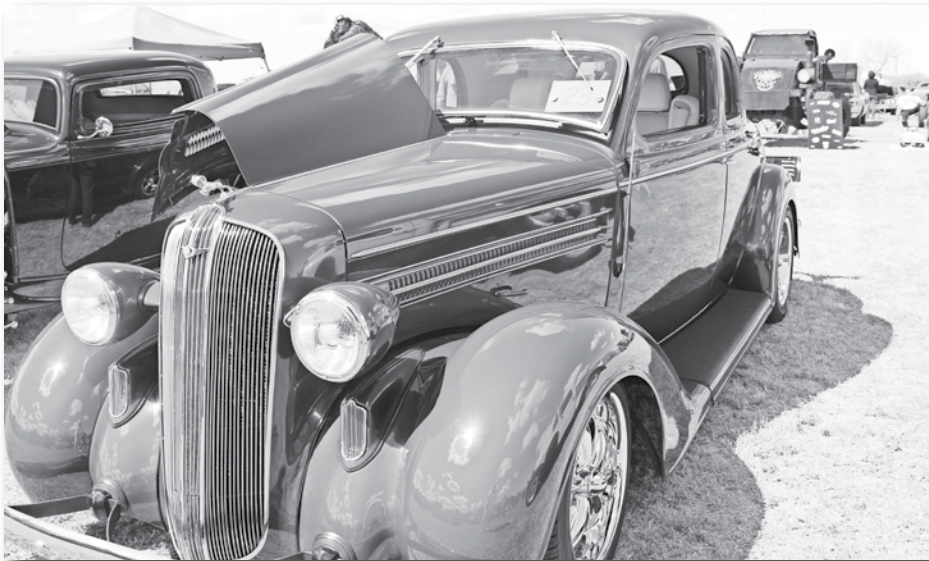
Best Interior, Red 1936 Dodge Coupe - Troy Rupp (Marana)