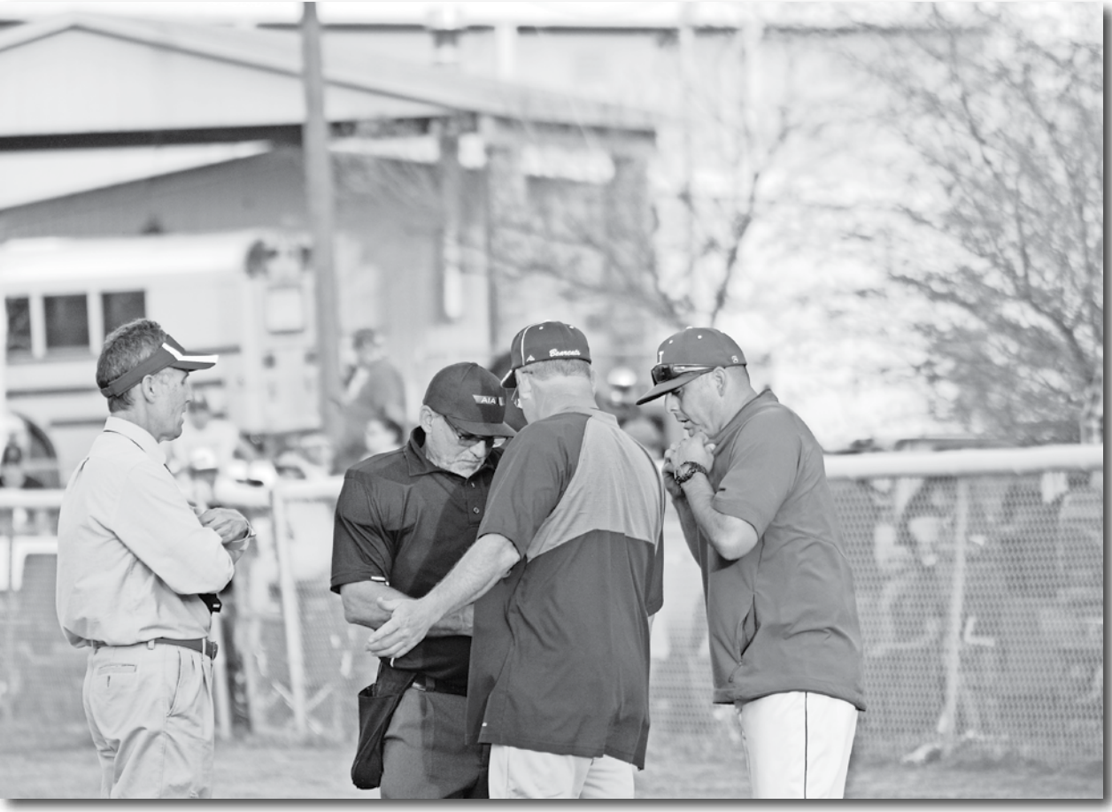
Baseball officials confer after a fight broke out on the field at the Ray-Hayden varsity baseball game.