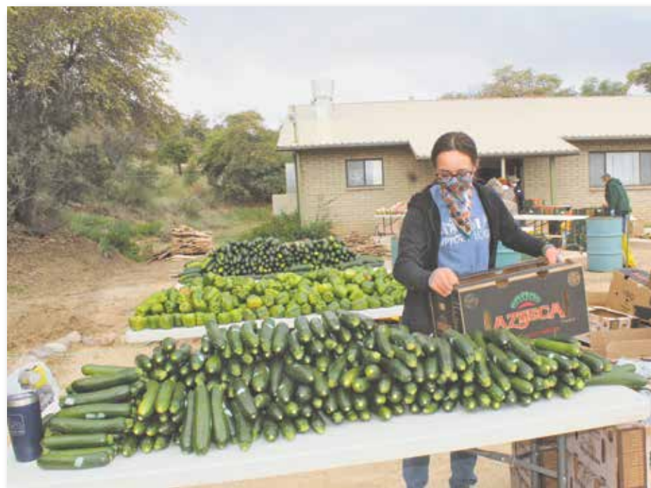
A volunteer stacks produce for the Tri-Community's first Produce on Wheels Without Waste distribution.