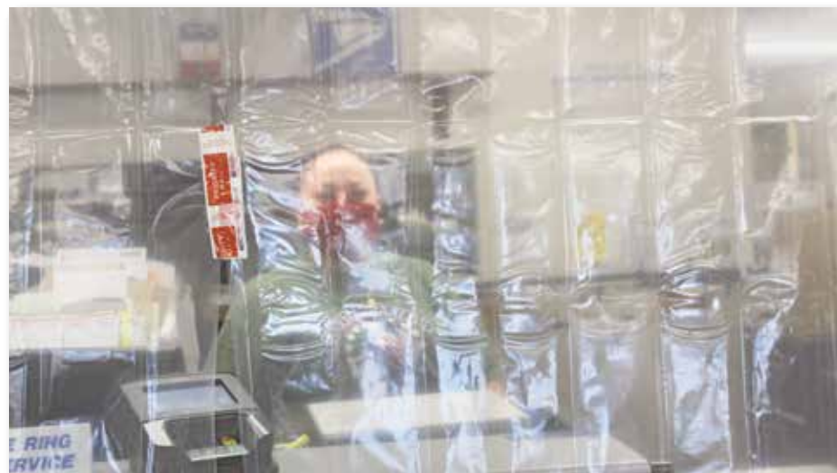
The Oracle Post Office has a barrier to help protect their employees and customers.

The Oracle Community Center is providing COVID-19 updates on their Facebook page in Spanish and English. Other individuals are sharing updates and information with friends. Many positive things are happening in Oracle. A community coming together realizing that we are all in this together.