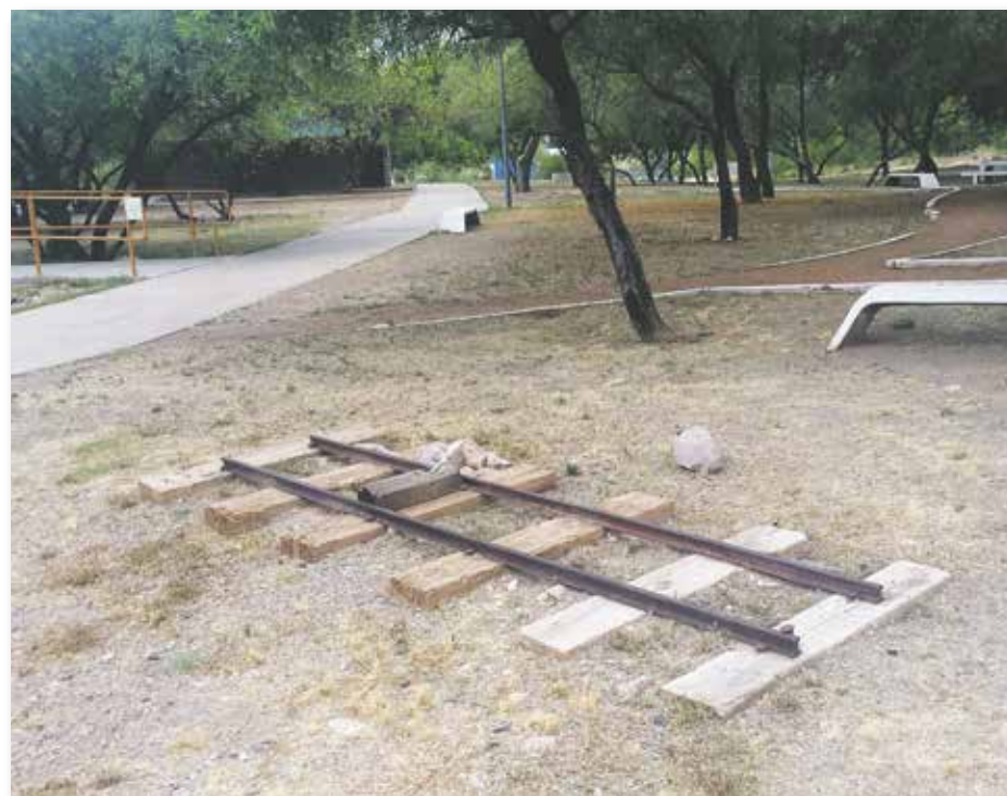
All that is missing is the Superior Ore Cart and that will be installed in time for the ribbon cutting and dedication ceremony on April 25 at the Caboose Park and Superior History Trail. Mila Besich-Lira | Superior Sun

The park is located at 834 W. Hwy. 60. It is located on the north side of the highway across from Los Hermanos Restaurant.