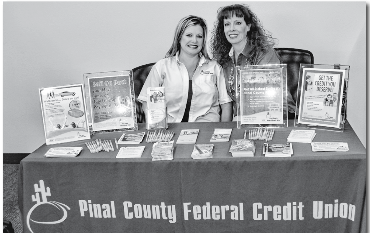
Pinal County Federal Credit Union was one of the participants at the fourth annual CAC Job Quest.

College Health Careers; and University of Arizona Cooperative Extension.