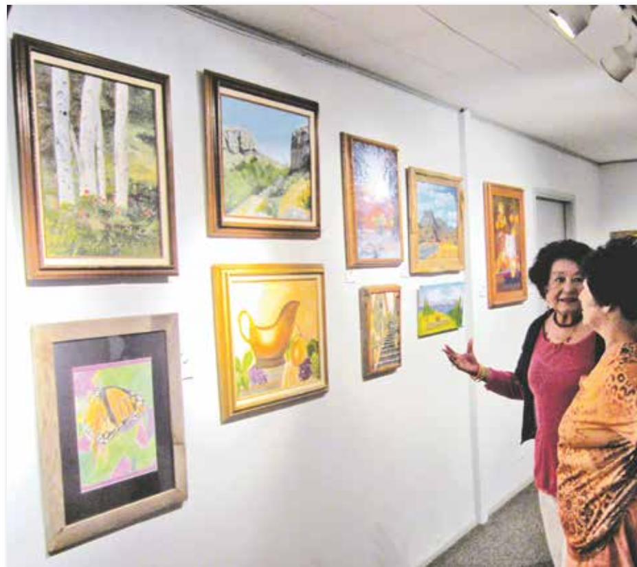
The 11th annual ArtUs show will be in The Little Gallery starting Sunday, Apr. 19 with an opening reception from 2 p.m. to 4 p.m. and is shaping up to be as good as those in the past.

The church compound also offers a spectacular walking experience through The Little Garden. Paths lead walkers through the desert around the church with amazing views of the mountains in the distance and the valley surrounding the Gila River below. This time of the year the desert is alive with the beauty of spring and the walk is very rewarding. The Little Garden is always open.