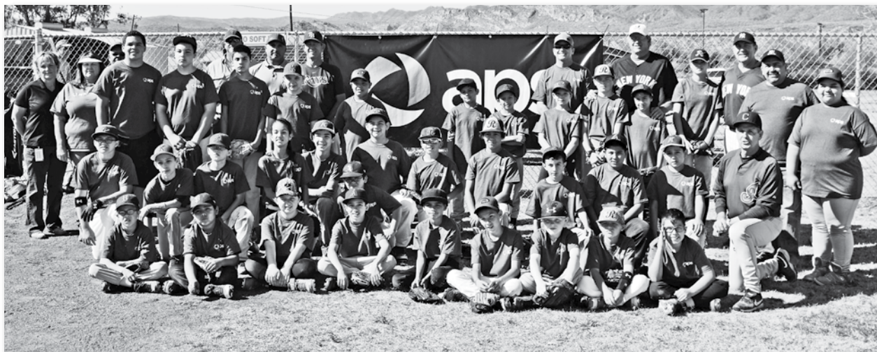
Kearny Little League with Former Professional MLB Players. The workshop was sponsored by APS.

fun." APS helped put this event together for the Kearny Little League. APS started the Perfect Game Program in 1998 and continues to put together events like this to involve the young people of rural communities to bring enjoyment and support back to the communities they serve. Judged by the strong turn out the community appreciates the efforts.