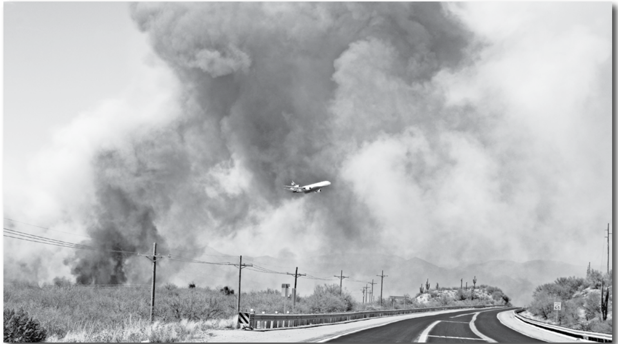
A retired passenger airplane drops fire retardant on the Margo Fire Thursday.

Over the weekend, Highway 177 between Superior and Kearny was closed several times due to brush fires along the highway. Everyone is reminded to be fire safe, as Arizona is bracing for a very serious fire season due to lack of rains and the extremely dry underbrush.