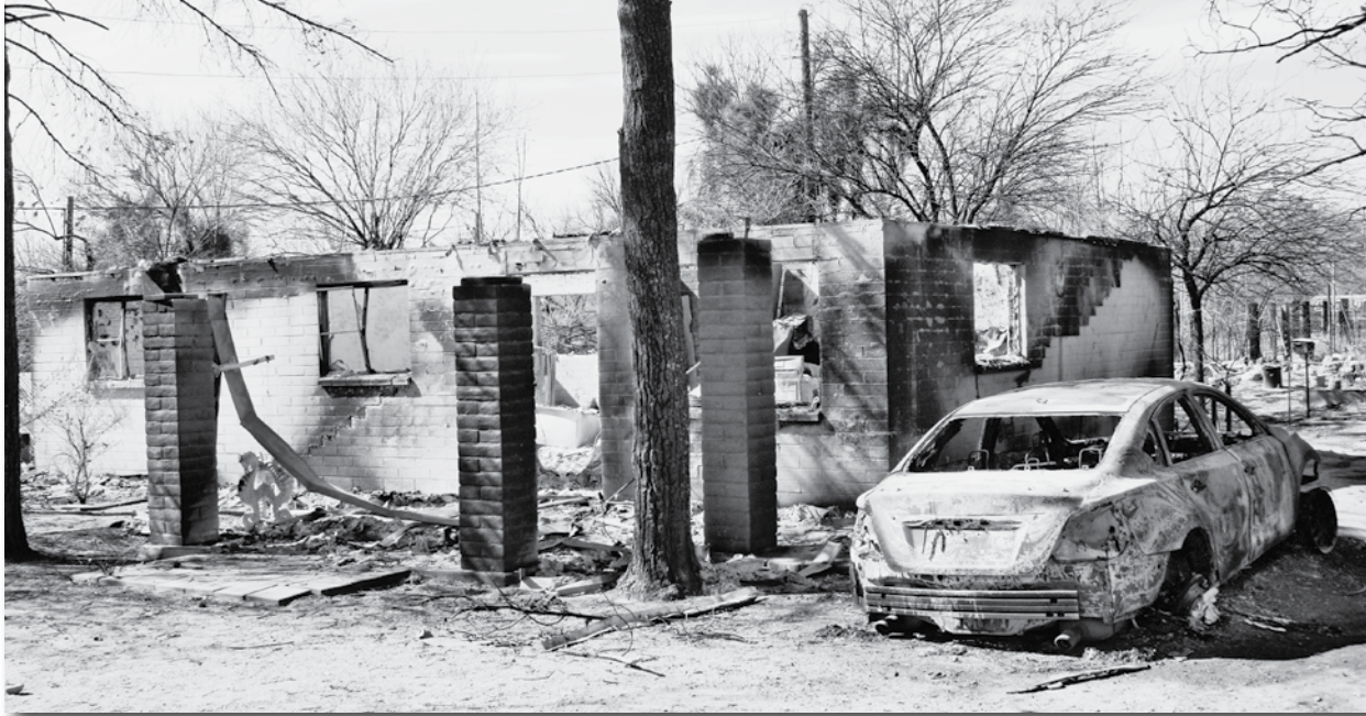
Twelve structures were lost in the fire as was this vehicle.