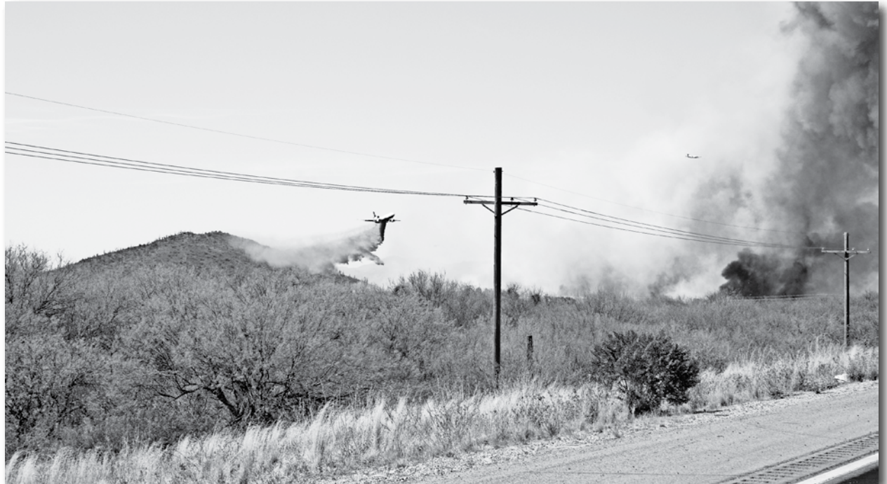
A retired passenger airplane drops fire retardant on the Margo Fire Thursday.