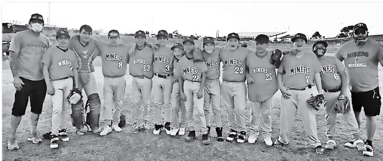
The high school baseball team isn't the only one having some success. On Monday, the San Manuel Junior Miners posted a 15-14 win over Eloy. Congratulations, Jr. Miners!

Union, the girls picked up the pace, and played an intense game. By the end of the third inning it was 12-0. The fourth inning was concluded with an additional 11 points being added to the board. The game ended after the fifth inning, giving San Manuel the victory, the final score 23-0.