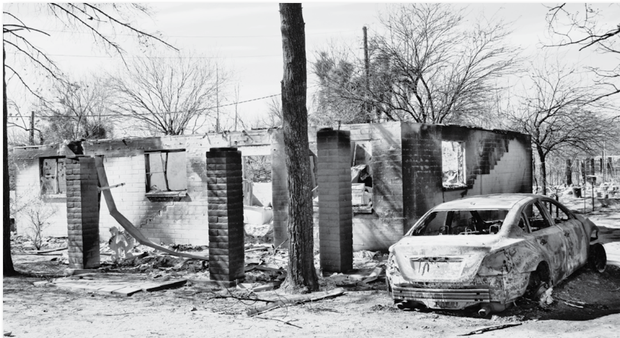
Twelve structures were lost in the fire as was this vehicle.