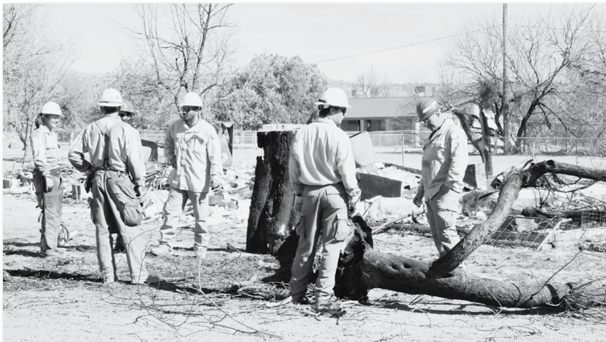
Fire crews were still busy Sunday afternoon cleaning up.