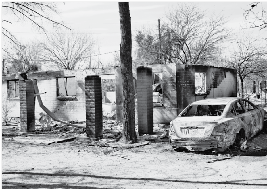
Twelve structures were lost in the fire as was this vehicle.