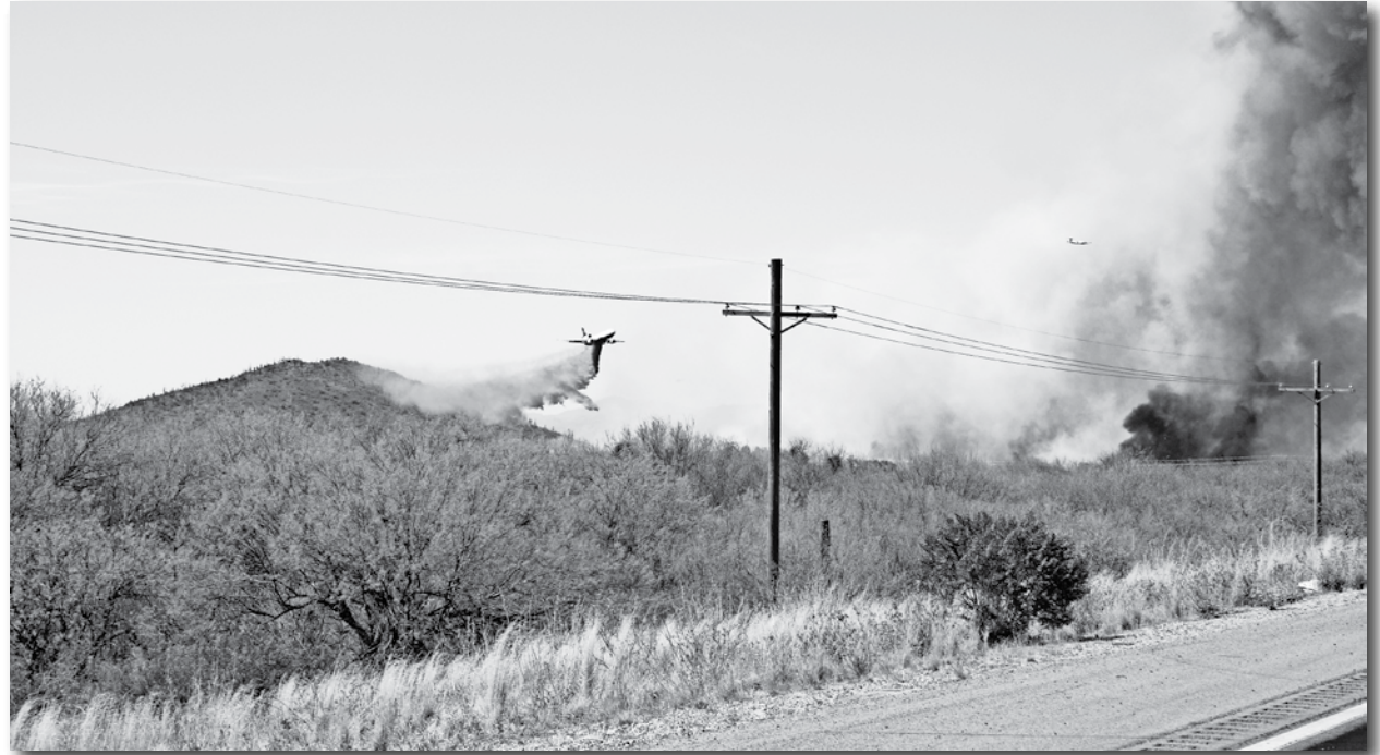
A retired passenger airplane drops fire retardant on the Margo Fire Thursday.

Over the weekend, Highway 177 between Superior and Kearny was closed several times due to brush fires along the highway. Everyone is reminded to be fire safe, as Arizona is bracing for a very serious fire season due to lack of rains and the extremely dry underbrush.