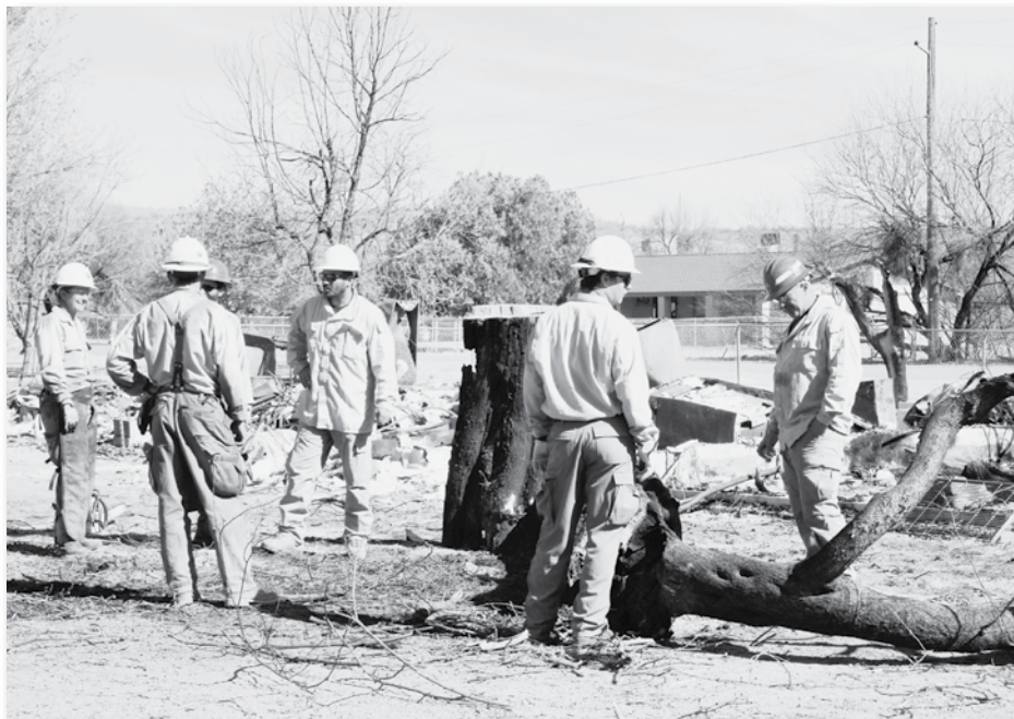
Fire crews were still busy Sunday afternoon cleaning up.