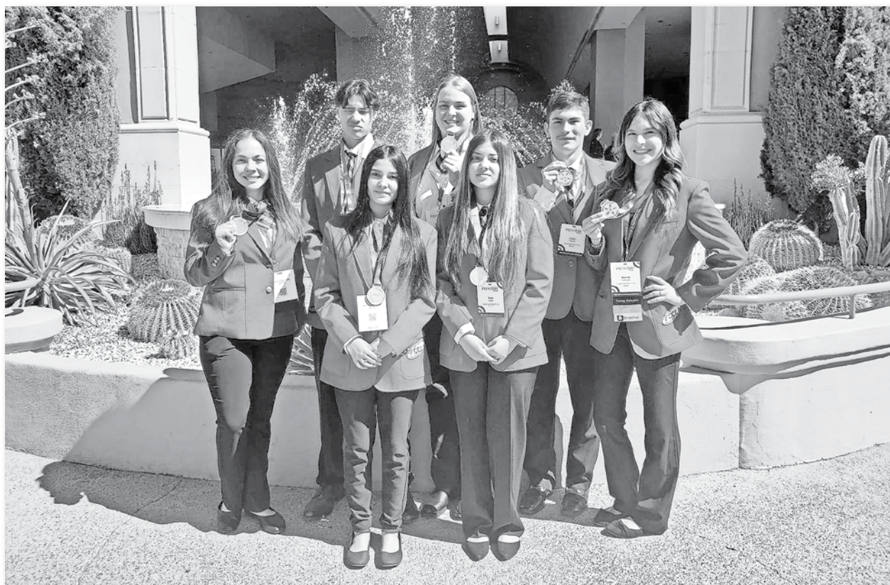
Members of the Superior High School FCCLA.

These students prepare all year to compete in these competitions at the state level. They also conduct a variety of school and community service events. FCCLA is part of the Career Technical Education programs provided at the Superior Junior-Senior High School.