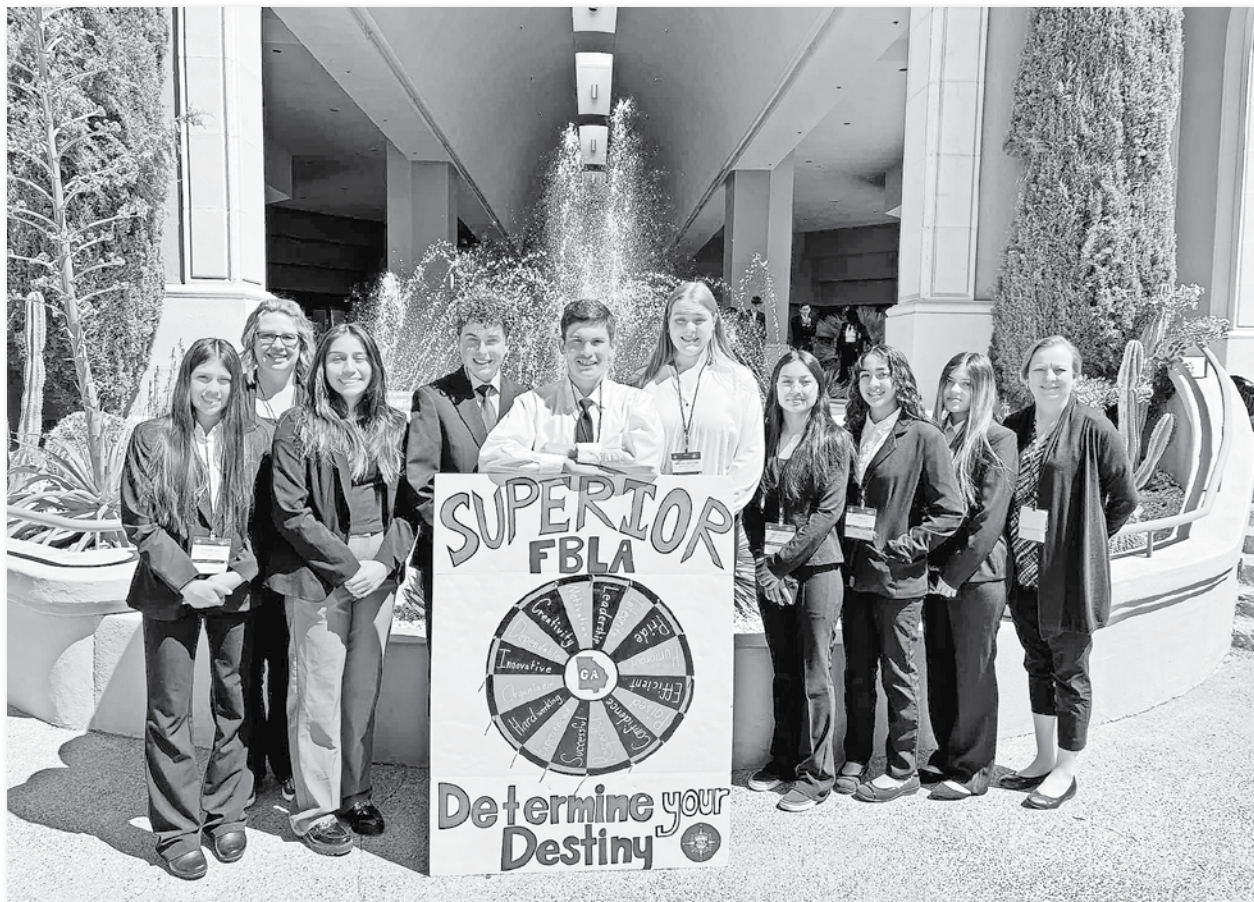
Members of the Superior High School FBLA.

FBLA is a program within the Career Technical Education programs at the Superior Junior-Senior High School. FBLA focusses on growing business leaders and helps to advance those skills.