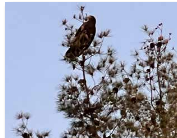
A Harris hawk perches in the top of a pine tree.

Come early, stay late and plan your trip for maximum pleasure, including remembering to bring your own folding chairs. All events are free with park admission, but remember, some need a reservation, food requires money and you’ll probably need some shade gear.