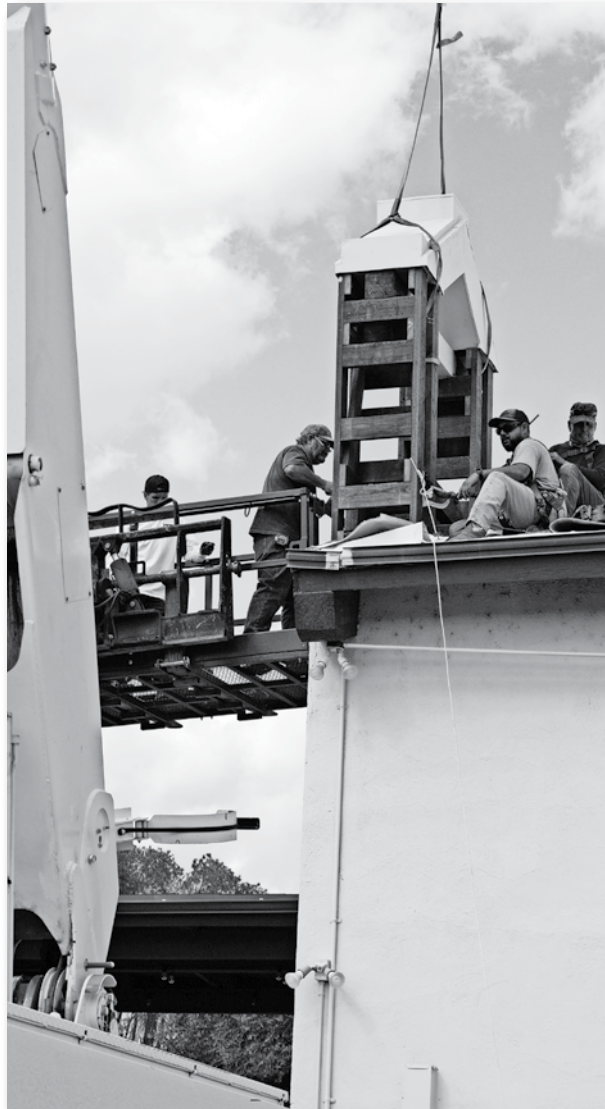
It took a lot of effort and a lot of people to replace the bell tower.