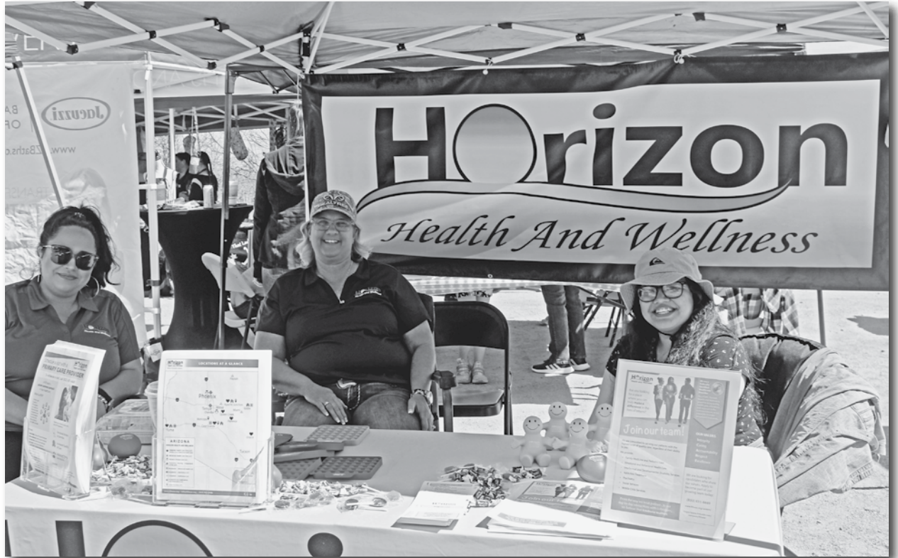
Local groups set up informational booths at the Oracle Oaks Festival. Above are two: Family First Pregnancy Care Center and Horizon Health and Wellness.