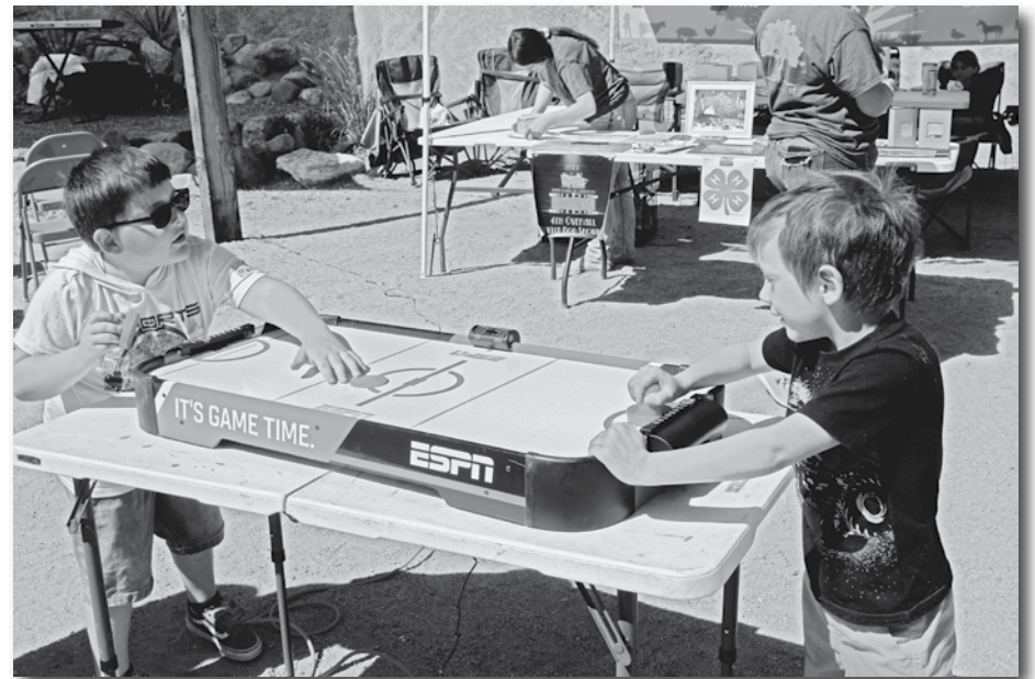
There were lots of fun and games for the kiddos at this year's Oracle Oaks Festival.