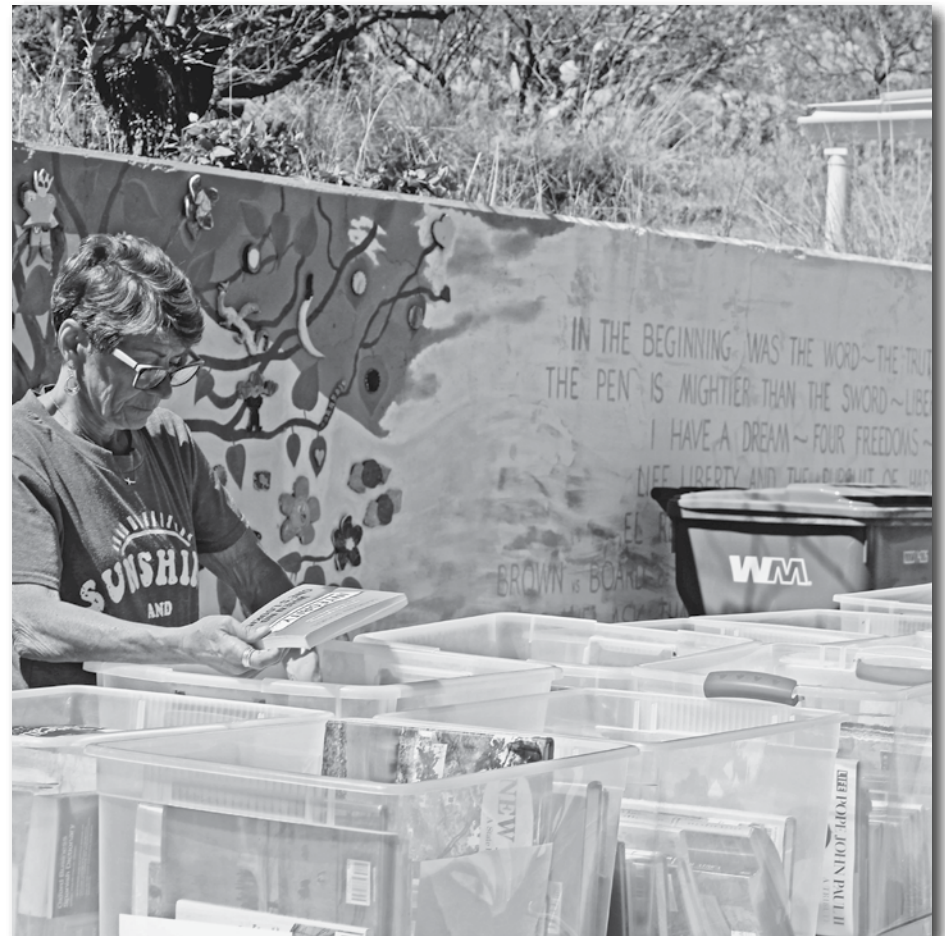
The Oracle Public Library held its annual book sale on Saturday, just next door to the Oracle Community Center taking advantage of the crowd.