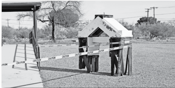
The old bell tower is removed.