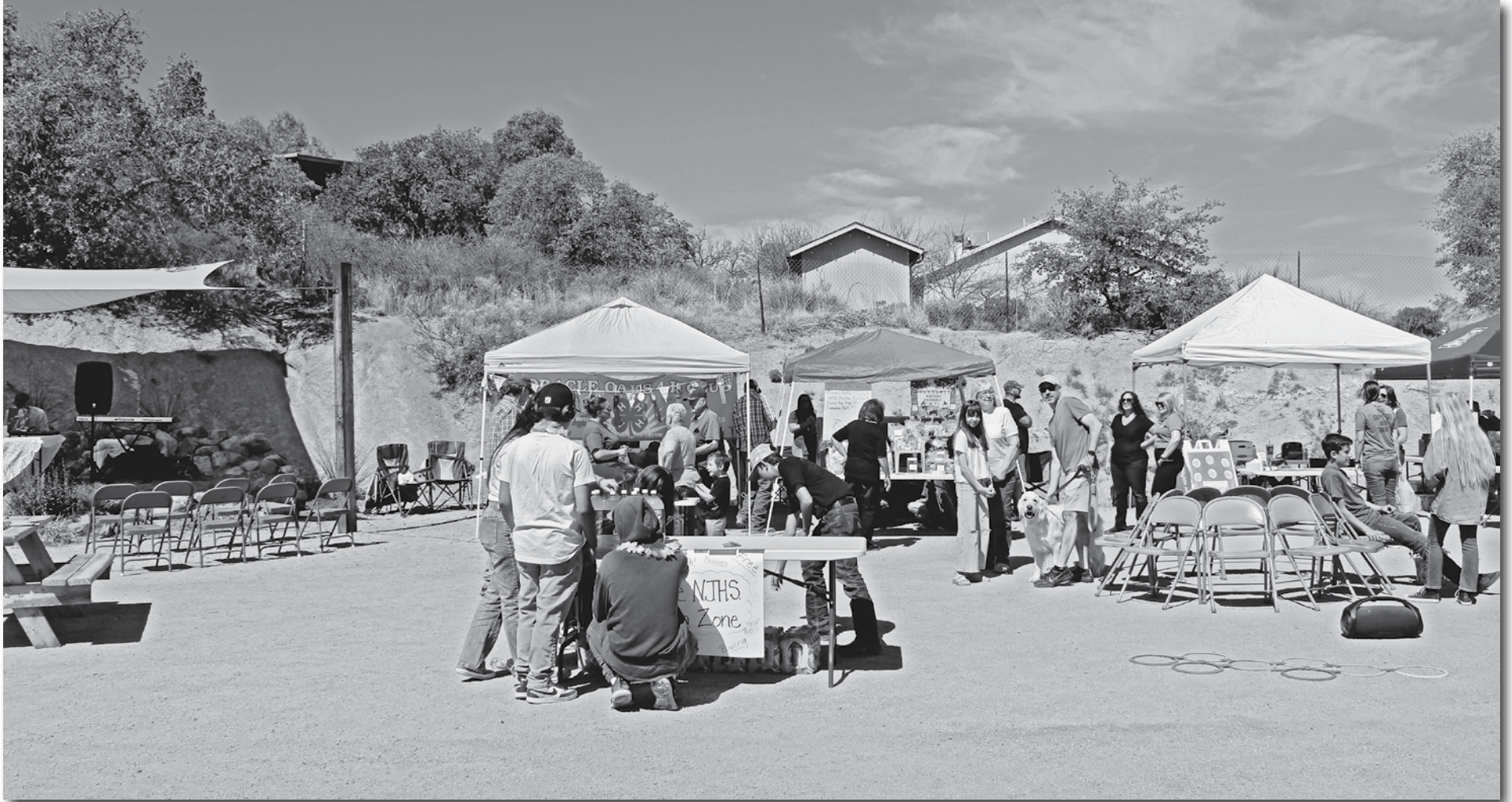
Couldn't have asked for a prettier day for the Oracle Oaks Festival. It made its triumphant return after COVID kept it away for the past few years.