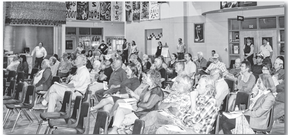
Citizens attend a meeting that will help determine the outcome of Apache Leap.