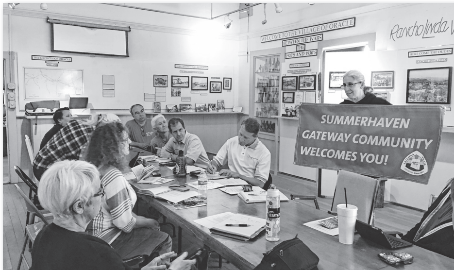
Members of the Arizona Trail Gateway Community Advisory Committee consider the new signage for the Arizona Trail at Summerhaven. The group met late last month in Oracle.

The next meeting is scheduled to be held in Pine in August.