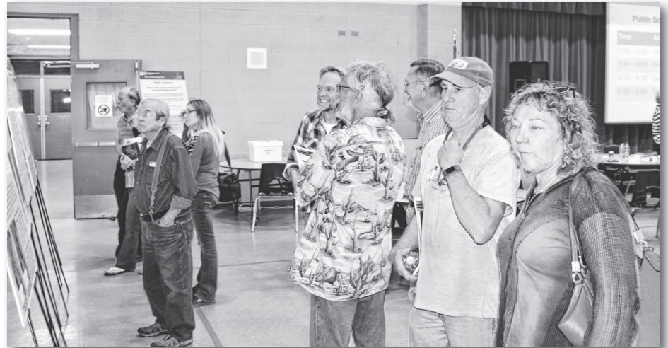
Citizens look at displays detailing different ways to manage Apache Leap.