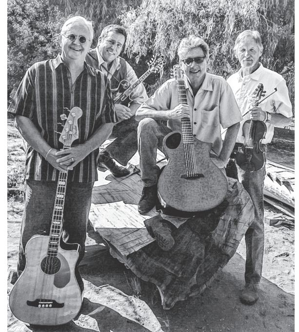
Trio Rio to perform Saturday at the Arboretum.

Drive up early to attend a Wildflower guided walk at 10 a.m. or a general tour of the main trail at 11 a.m.; general tours are daily this month, and the schedule for specialized nature walks is online.