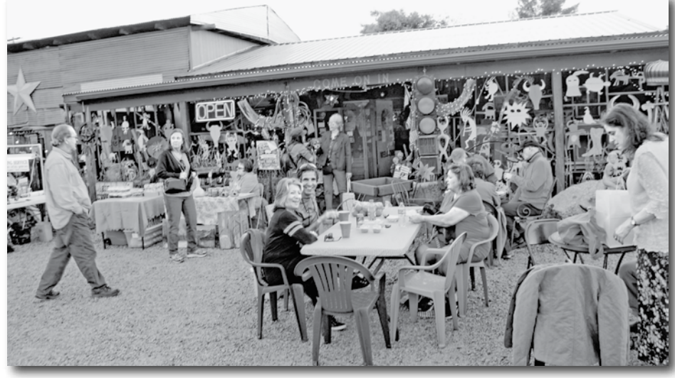
Enjoying good food and good music at the Oracle Farmers Market.