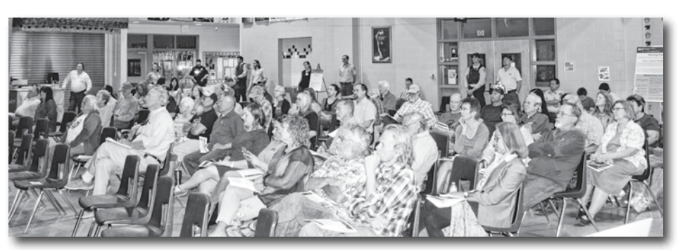
Many concerned about the outcome of the Apache Leap Escarpment turned out fat a meeting hosed by the Tonto National Forest District.