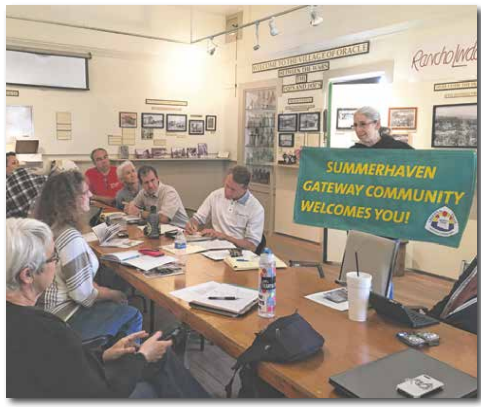
Members of the Arizona Trail Gateway Community Advisory Committee consider the new signage for the Arizona Trail at Summerhaven. The group met late last month in Oracle.