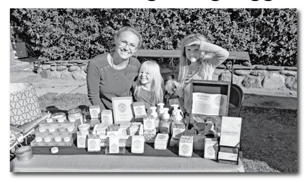
Selling White Bell Soap - handcrafted goat's milk soap, lotions and soy candles.

Come and support the community and have fun.