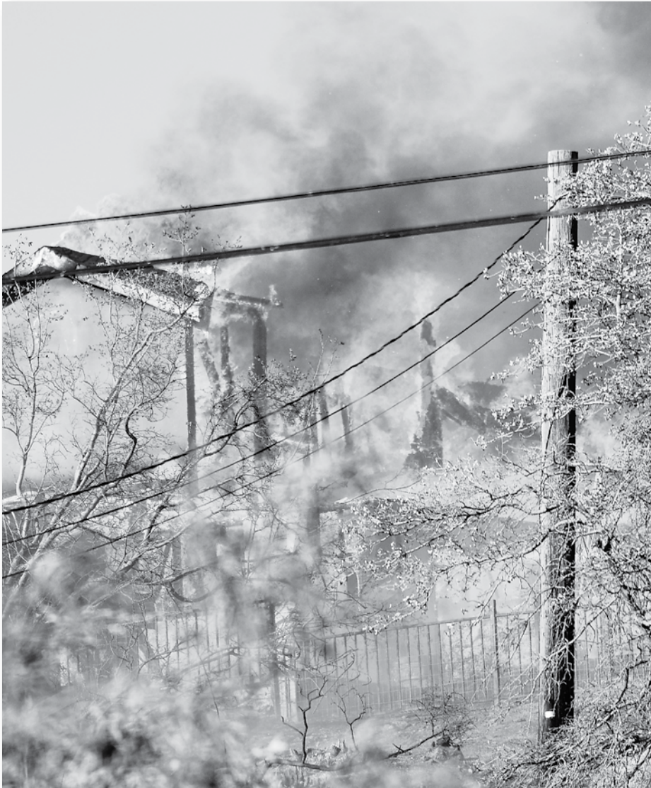
Oracle wildfire, 2014. This house burned, but could have been saved if the homeowner had maintained a defensible space around the home.