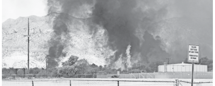
Kearny River Fire, 2015