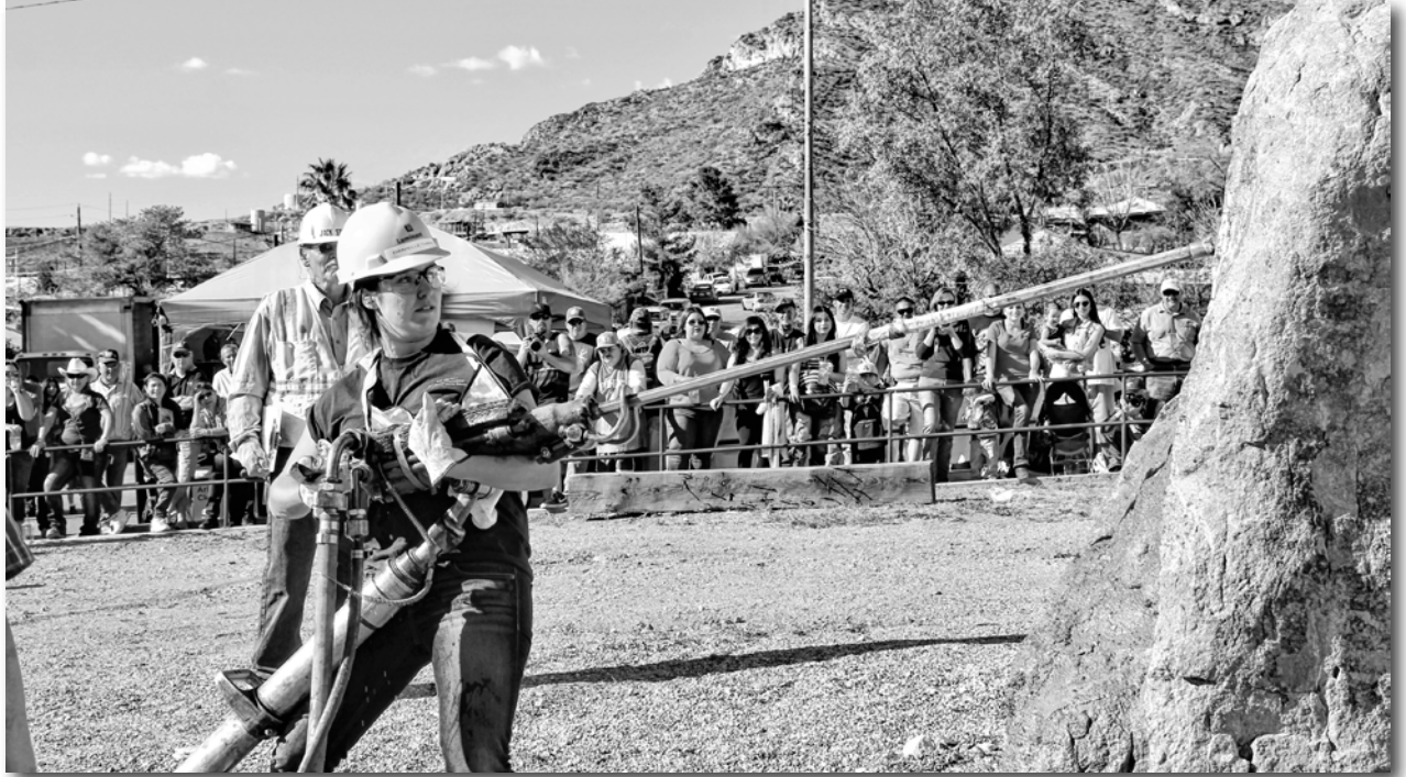
The mining competition is one of the most popular events during the Apache Leap Mining Festival.

Festival takes place on Main St., Superior. The event is family oriented and ALL FREE except carnival and vendors. Check the Chamber of Commerce website for schedules and updates. www.superiorarizonachamber.org or call 520-689-0200.