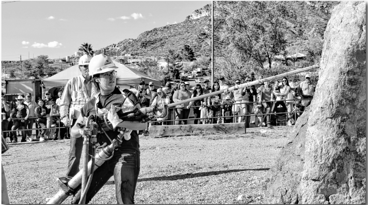
The mining competition is one of the most popular events during the Apache Leap Mining Festival.

Festival takes place on Main St., Superior. The event is family oriented and ALL FREE except carnival and vendors. Check the Chamber of Commerce website for schedules and updates. www.superiorarizonachamber.org or call 520-689-0200.