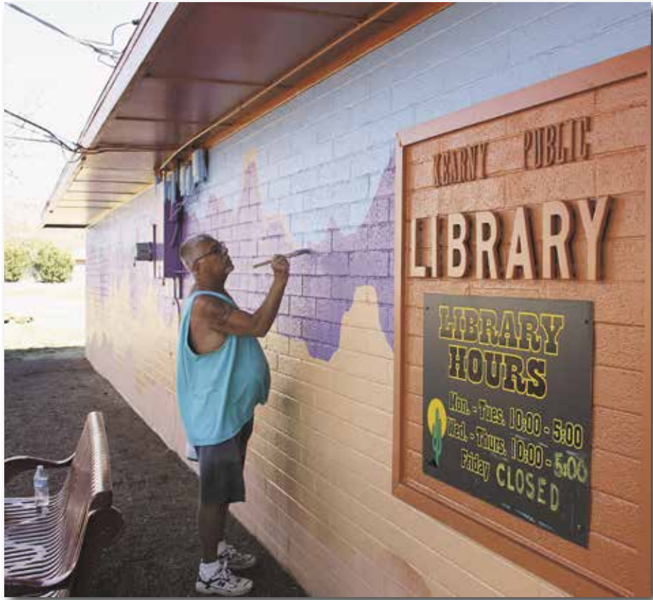
A volunteer touches up the mural painted on the side of the Kearny Public Library, just in time for Pioneer Days.