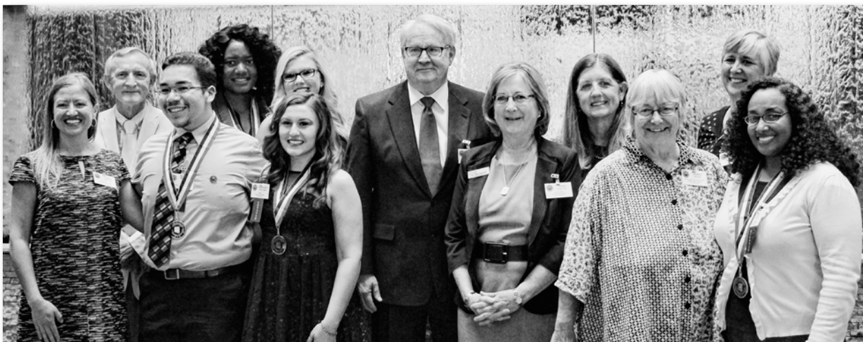
CAC's All Arizona Academic Team