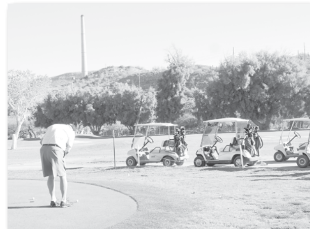
The Mammoth-San Manuel Education Foundation's annual golf tourney is Saturday in Hayden.

SERVING THE TRI-COMMUNITY, CATALINA, ORO VALLEY, TUCSON, DUDLEYVILLE, WINKELMAN, KEARNY