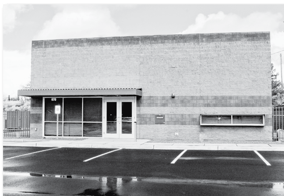
Arizona Water Company's new office.