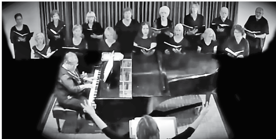
Voices in the Oaks Chorale practicing at the Oracle Center for the Arts.