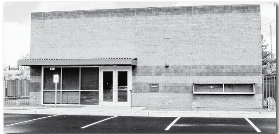
Arizona Water Company's new office.

Special offer valid through 03/31/2017. Subject to membership eligibility, loan is subject to credit approval, not all will qualify. Offer valid for direct lending only, offer not valid through Indirect Lending. Refinancing of vehicle loans currently held at PCFCU & Commercial vehicle loans are excluded. *Minimum loan amount for voucher: $10,000, Tax reporting of value of vacation voucher is member's responsibility. Other restrictions apply. Subject to change without notice. See credit union for details.