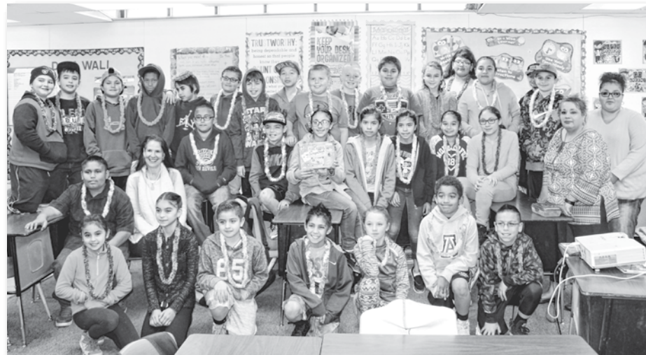
Fourth and fifth graders at Hambly K-8 School with their ceremonial leis.