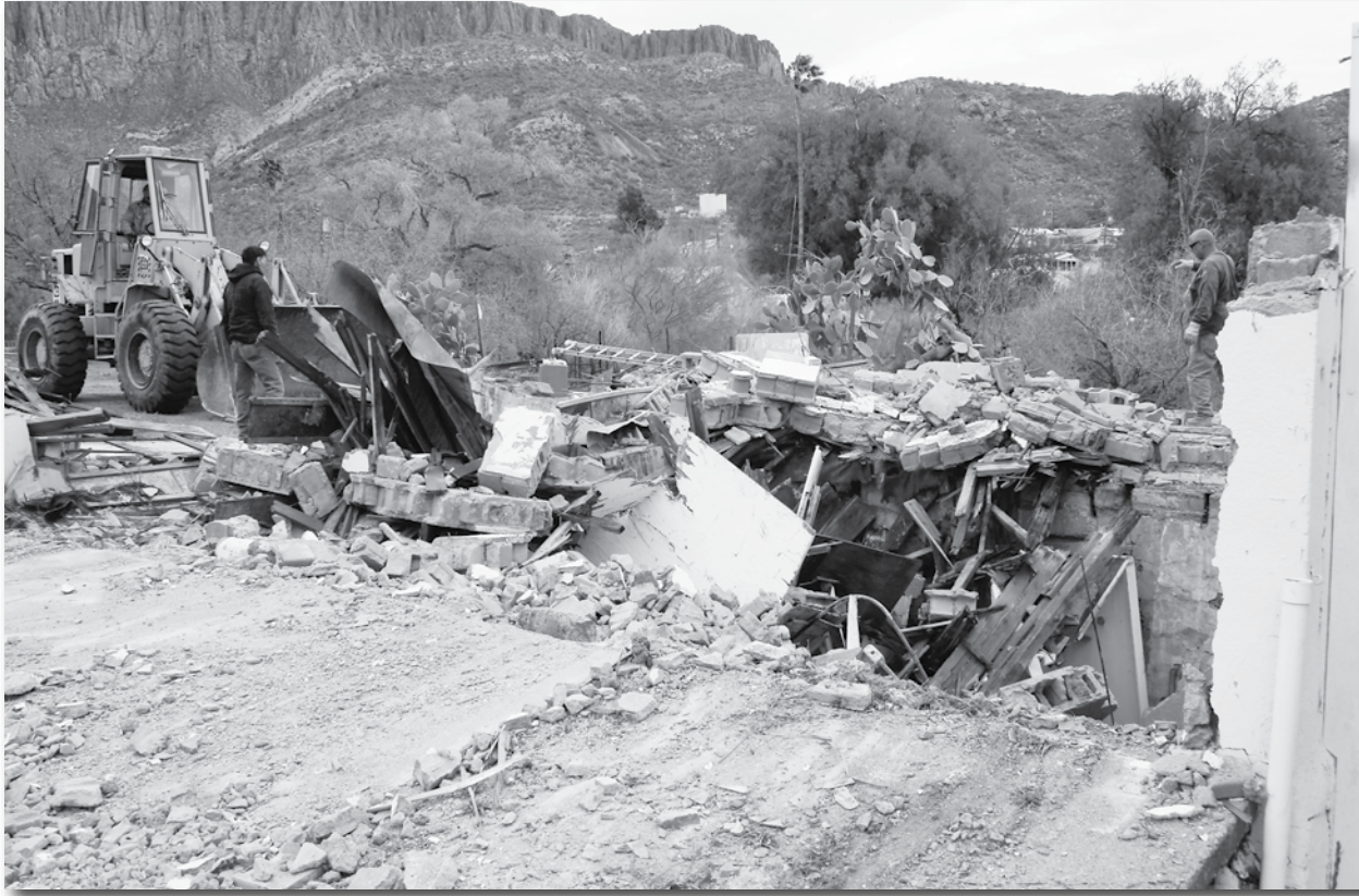
Workers clean up the materials from building located at 465 Main Street where the roof had caved in recently. Ed Eisele of Superior offered his equipment to help out.