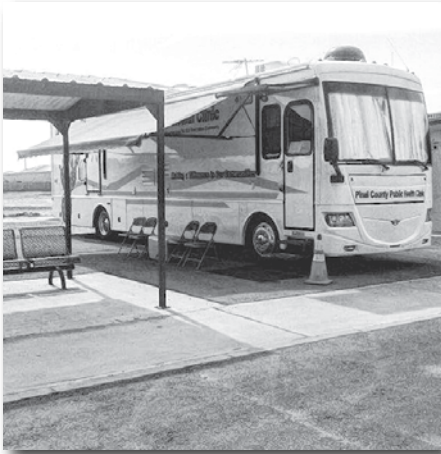
This is a picture of the former Mobile Health Clinic.

The recently released movie American Sniper has launched a conversation in this country on the treatment of our veterans once they returned from combat activities. This includes veterans from WW II, Vietnam, etc. It's a conversation that is overdue when you see the effects of soldiers suffering from PTSD and other injuries, some seen, some unseen.