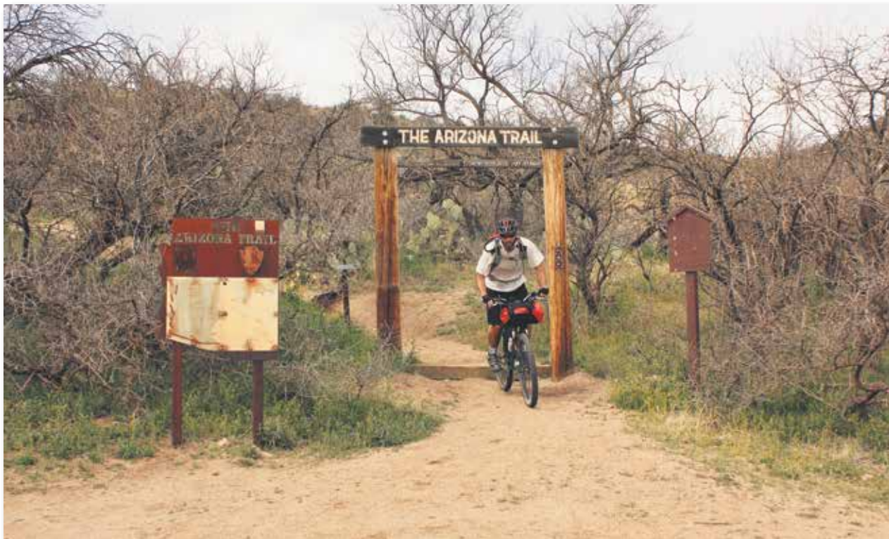
Mountain biking on the Arizona Trail.

The Legends of Superior Committee will be forming a 501c3 organization to be able to apply for grants to fund the construction of the trails as well as other trails in the area. Funding for the planning and mapping of the trail is being funded by Resolution Copper.