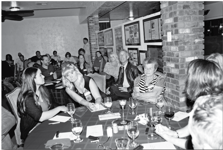
Local business owners were honored at a recent dinner at the Oracle Inn.