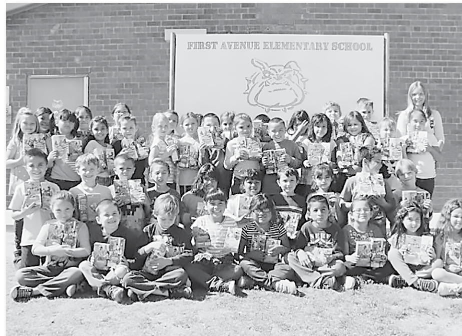
First Grade Bulldogs are sending more than 80 boxes of Girl Scout cookies to military troops, thanks to spare change First Avenue Elementary School students collected this month.