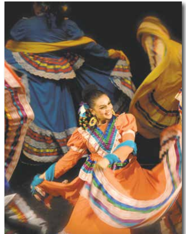
Ballet Folklórico Quetzalli de Veracruz sends their dresses swirling at a performance.

The Gold Canyon Arts Council promotes the performing and visual arts through its Canyon Sounds Artist Series. More about the organization can be found at www.gcac1.com . The council is supported in part by grants from the Arizona Commission on the Arts, Western States Arts Federation, the National Endowment for the Arts, local corporations, and businesses.