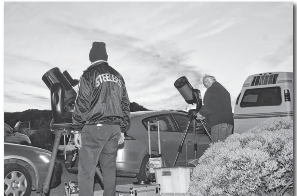
Astronomers set up their telescopes at a recent Star Party at the Oracle State Park.

Please join us on Facebook, Twitter or LinkedIn