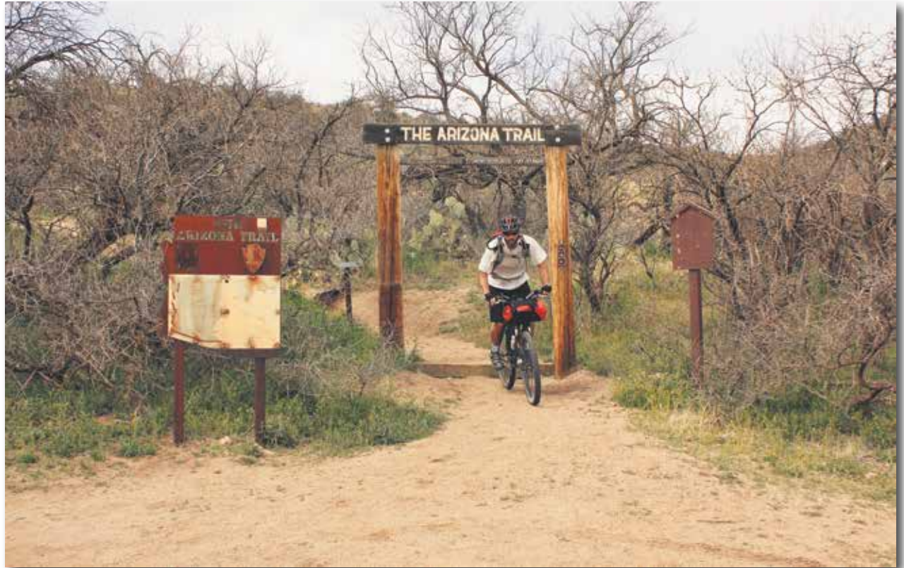
Mountain biking on the Arizona Trail.

The Legends of Superior Committee will be forming a 501c3 organization to be able to apply for grants to fund the construction of the trails as well as other trails in the area. Funding for the planning and mapping of the trail is being funded by Resolution Copper.