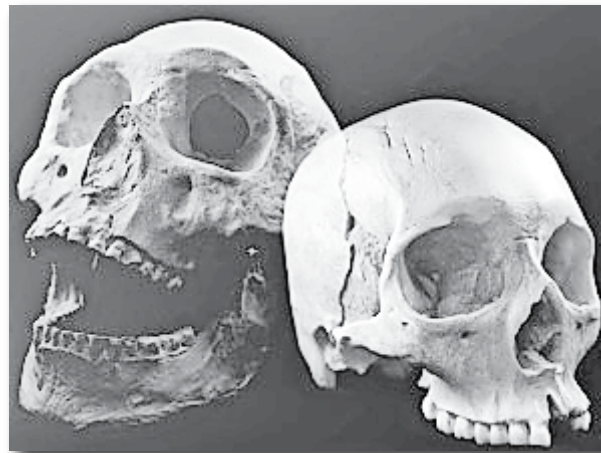
Why did the prison warden need the skulls from two executed prisoners?

NOTICE IS HEREBY GIVEN that the Town Council of the Town of Kearny is seeking letters of interest for appointment to fill an unscheduled vacancy on the Town Council. The candidate appointed to fill the vacant seat will serve as a Town Council Member until the certification of election results and installation of new officials at the next General Municipal Election to be held on November 8, 2022.