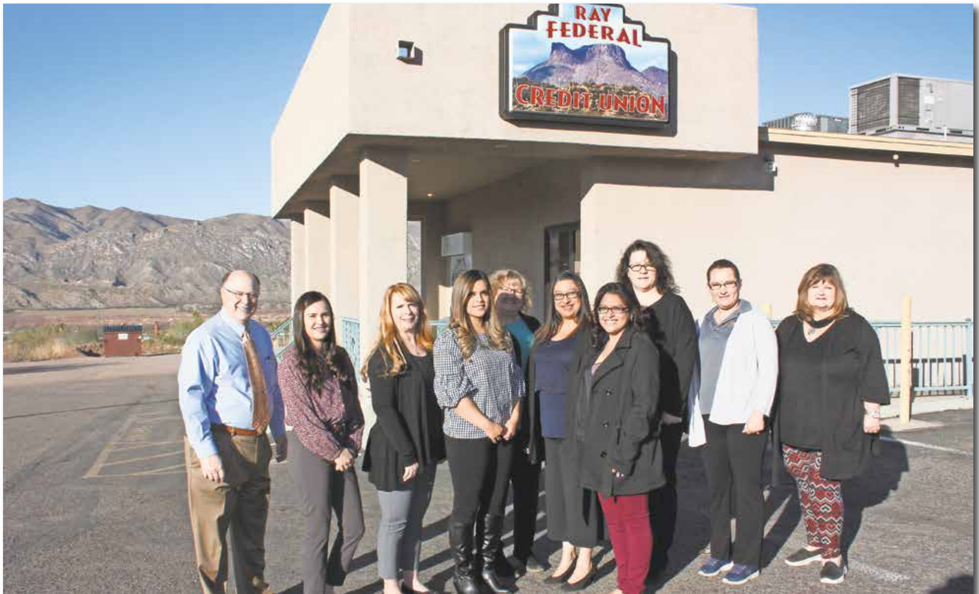
Ray Federal Credit Union team.