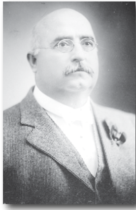
Gov. G.W.P. Hunt