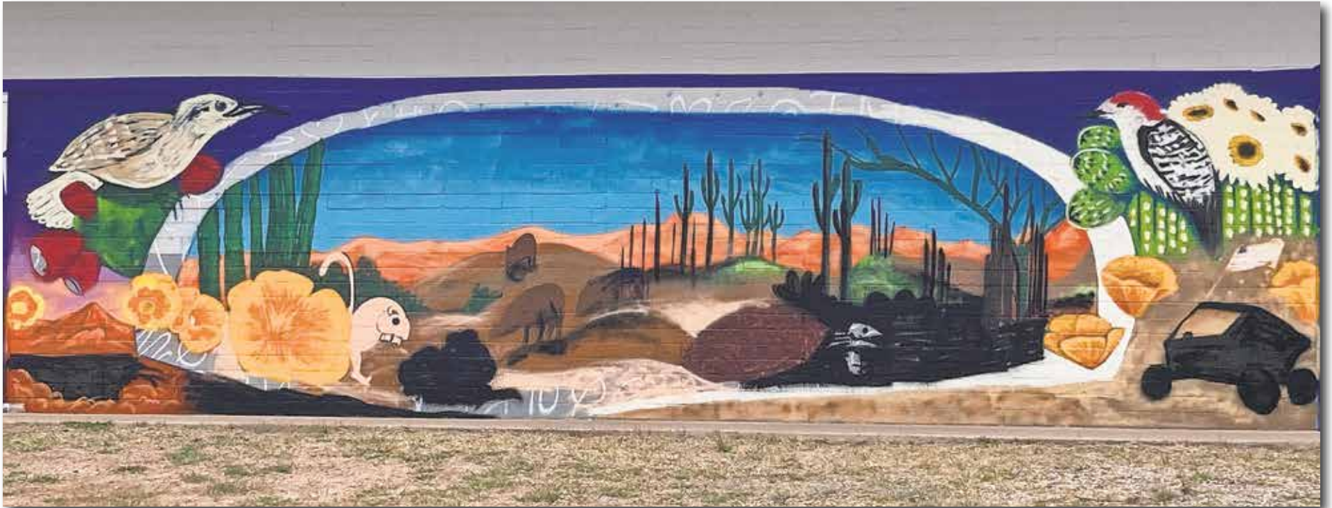
Artists made progress this weekend on the mural which decorates the wall of the San Manuel Community Center. What a beautiful representation of life in San Manuel. We can't wait to see the finished product.