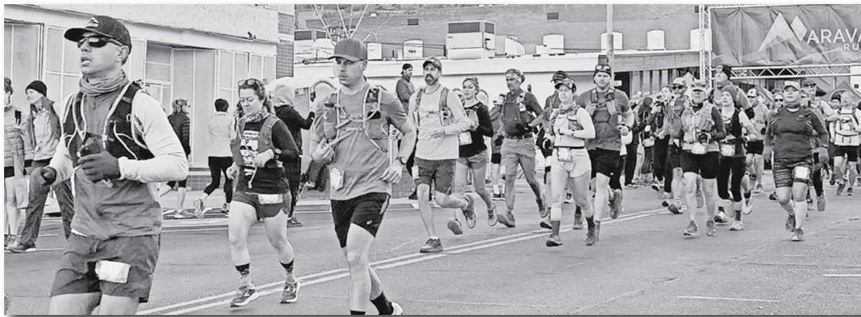
Superior played host to the Aravaipa Running Copper Corridor event Saturday. Approximately 350 runners competed in four different races: 50K, 32K, 17K and 12 K.