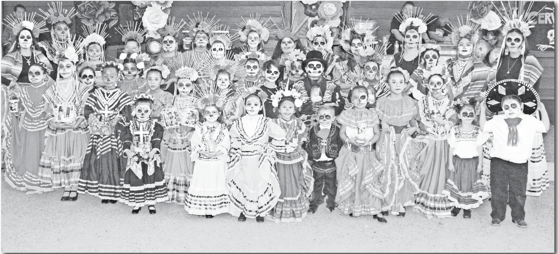
Superior Dance Company performed at the Dia de los Muertos celebration in Superior.