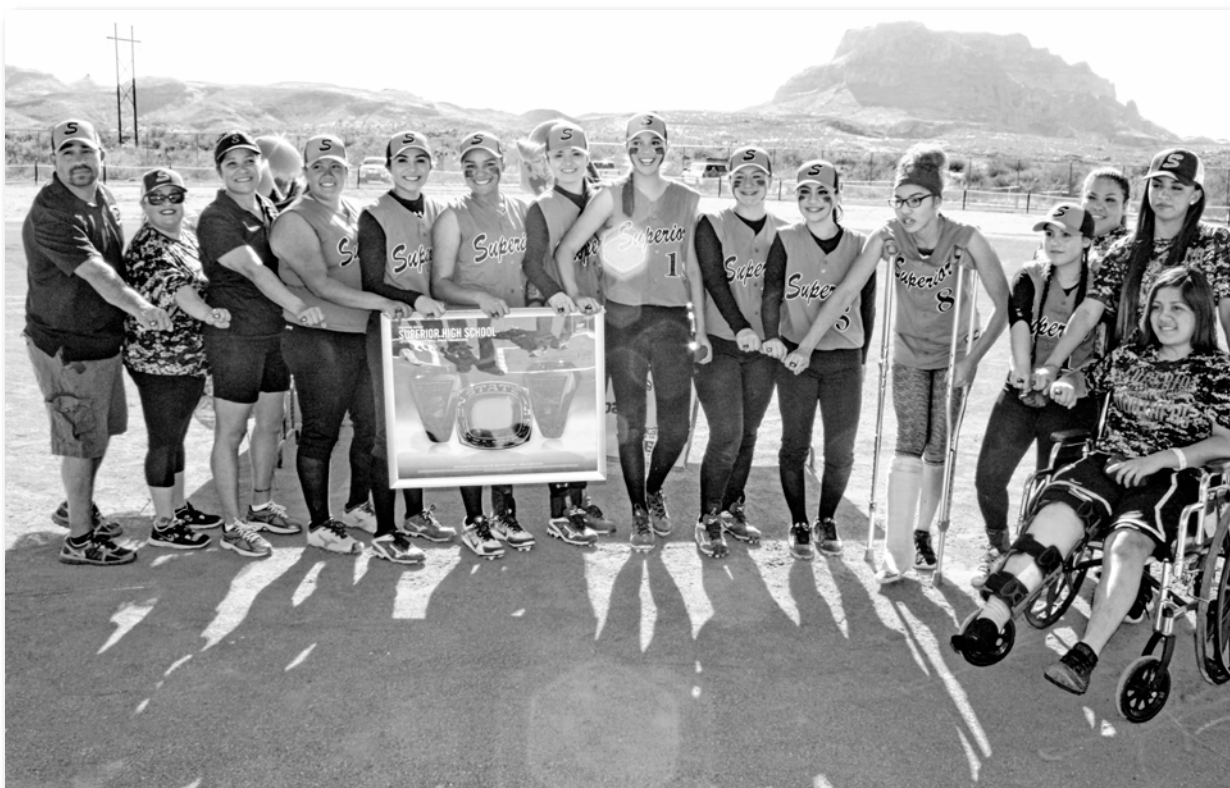
The 2015 Softball Championship team show off their rings.