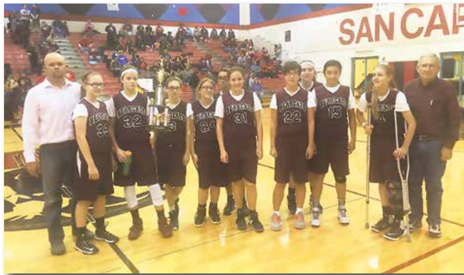
Ray 8th Grade Girls Basketball Team were crowned champs of the Central Junior High League.