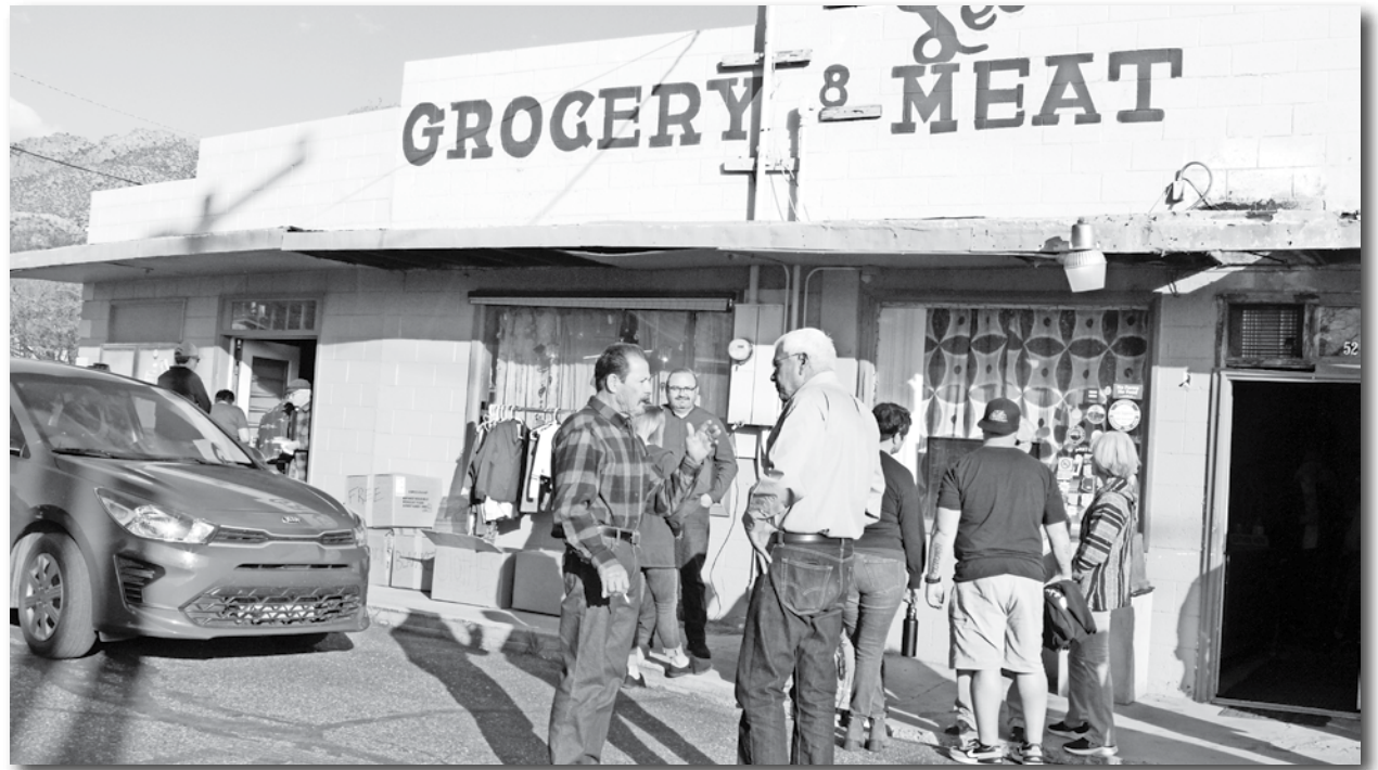
Regenerating Sonora hosted a block party last week.

Regenerating Sonora has been actively providing community activities such as movie nights and open mic sessions at the Leo's Community Development Center. They are also growing LEHR gardens to help grow more local produce in Superior.