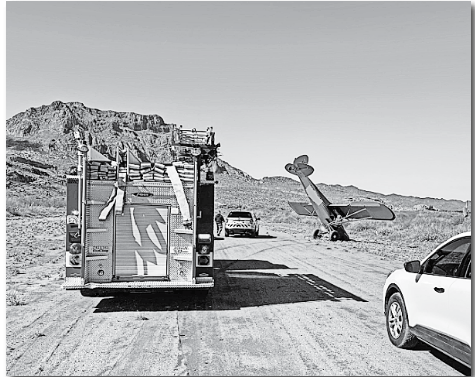
Superior's first responders make their way to the scene of a minor airplane crash last week.