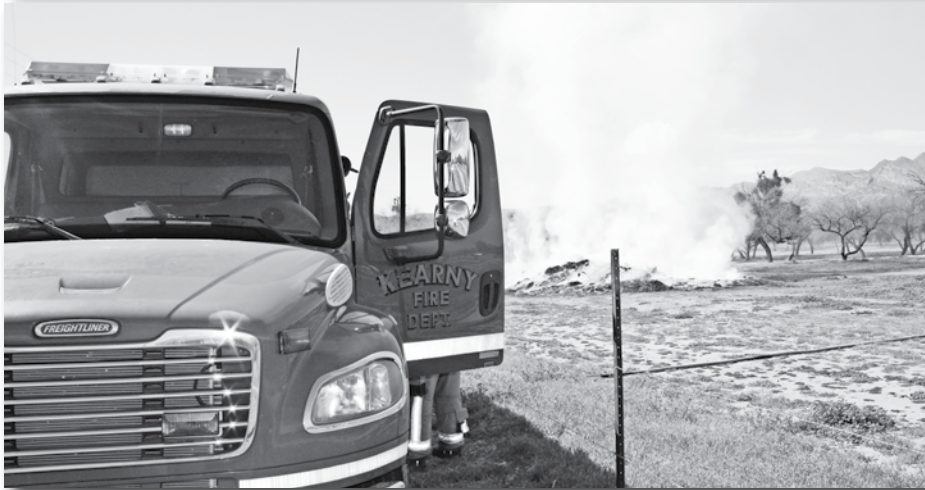
Kearny Firefighters were at the Kearny Golf Course Saturday tending a controlled burn. Wildfire season will soon be here and officials want to be ready.