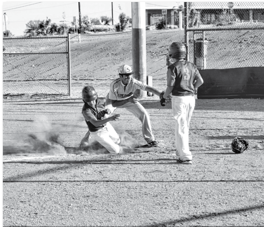
San Manuel Junior Miners took on Eloy last week.

Upcoming schedule: Mar. 26 @ Duncan, Apr. 1 vs. Ft. Thomas. Both games begin at 4:00 p.m.