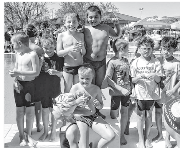
Sea Lion Swimmers on the podium receiving awards after winning the Medley Relay.