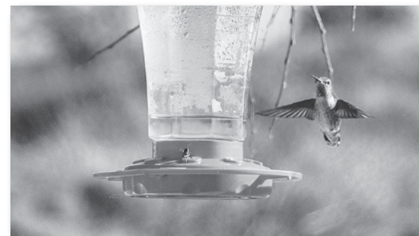
The hummingbirds provided a little entertainment for Star Party goers.