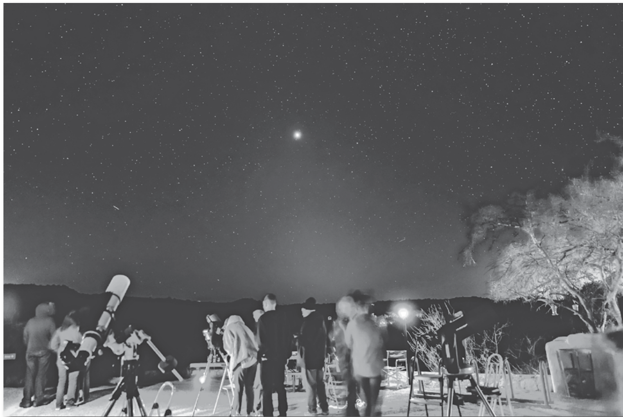
Viewing the Zodiacal Light in the western sky.