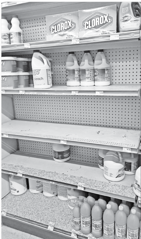
The shelves are bare. More deliveries possible soon.