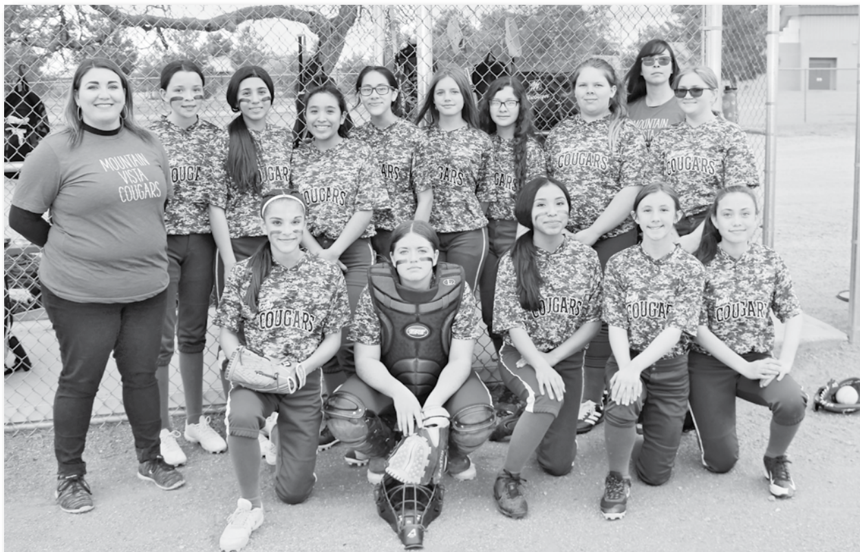
Mountain Vista's 2020 Softball Team.