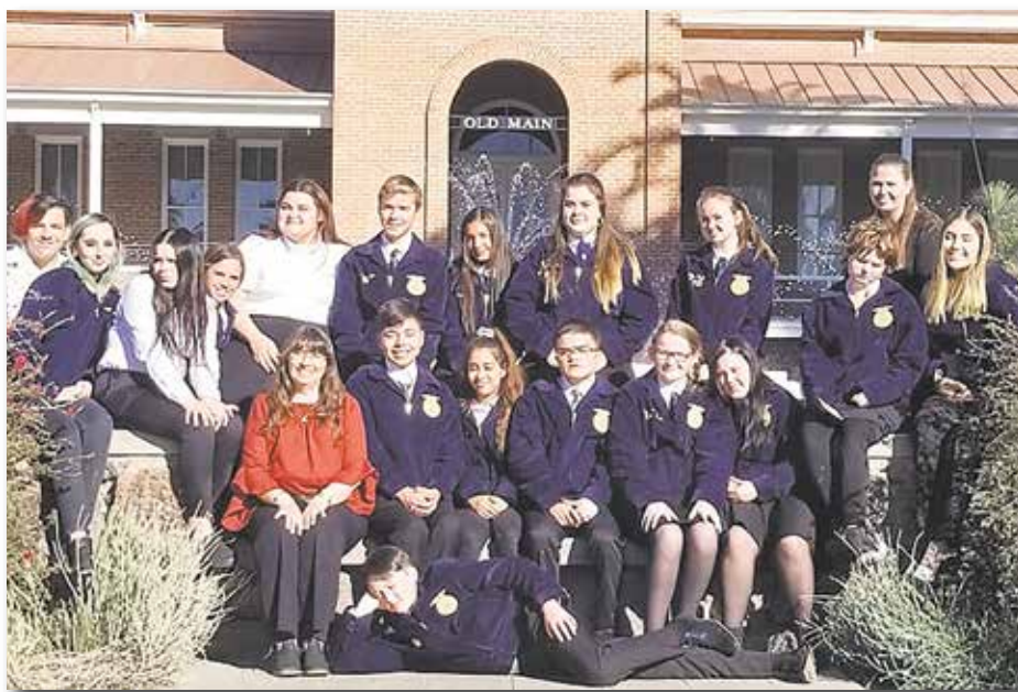
Team San Manuel FFA.