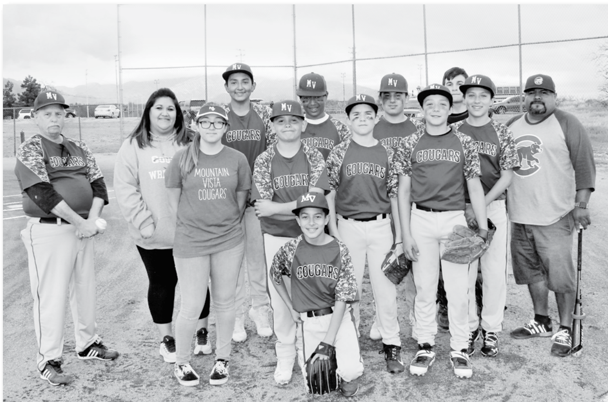
Mountain Vista's 2020 Baseball Team.