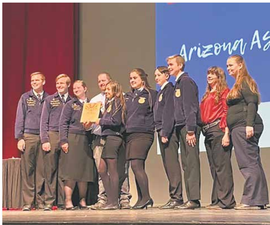
San Manuel's 6th Place Agronomy Team.