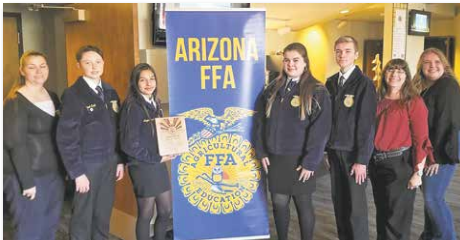
San Manuel's 1st Place Team.