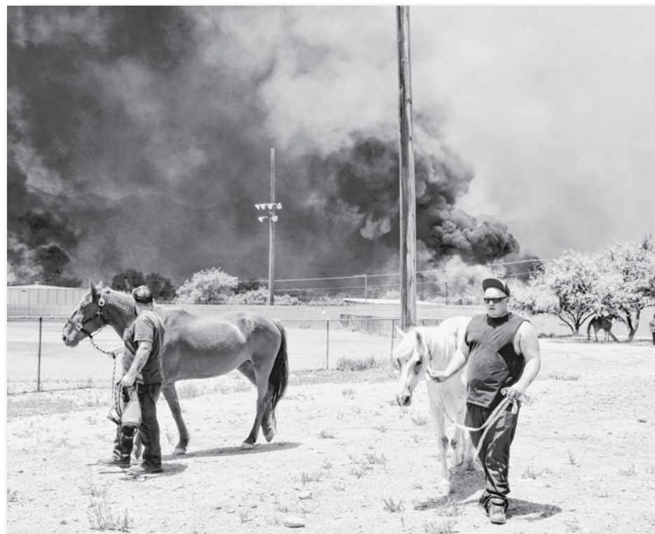
Are you prepared for a wildfire? Owners of animals have to be especially prepared in the event of an evacuation.