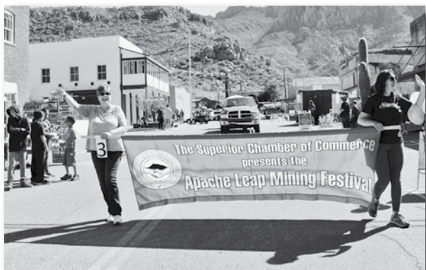
The Superior Chamber of Commerce.