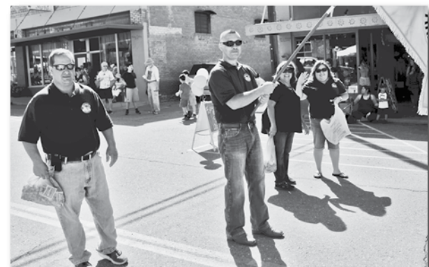
The Superior Town Council.