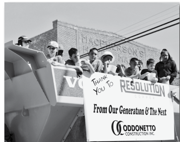
Oddonetto Construction Inc. entry.