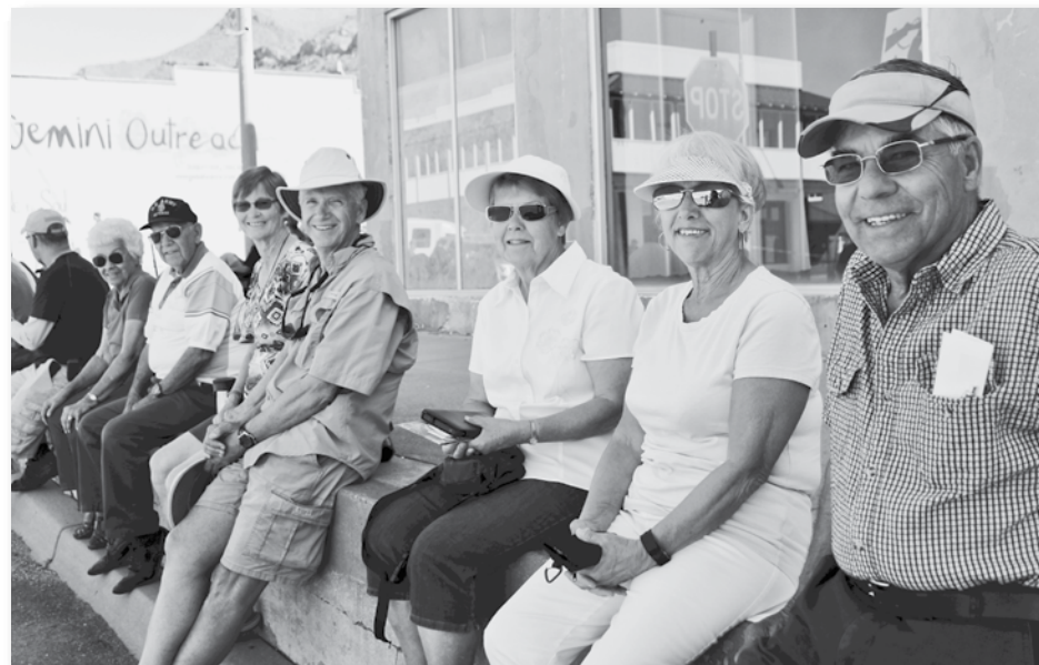
The annual Apache Leap Mining Festival parade is one of the most highly attended and anticipated parades in the region.