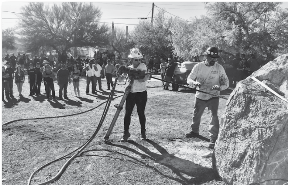
The mining competition is one of the most popular attractions of the Apache Leap Mining Festival.