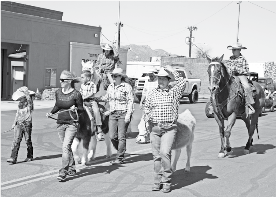
The Sanchez family represents during the Pioneer Days parade.