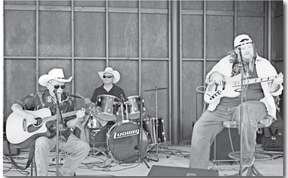
K-Town 3 performs during this year's Pioneer Days.