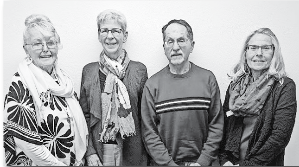
Pictured above (two photos) are the new volunteers for CASA of Gila County.