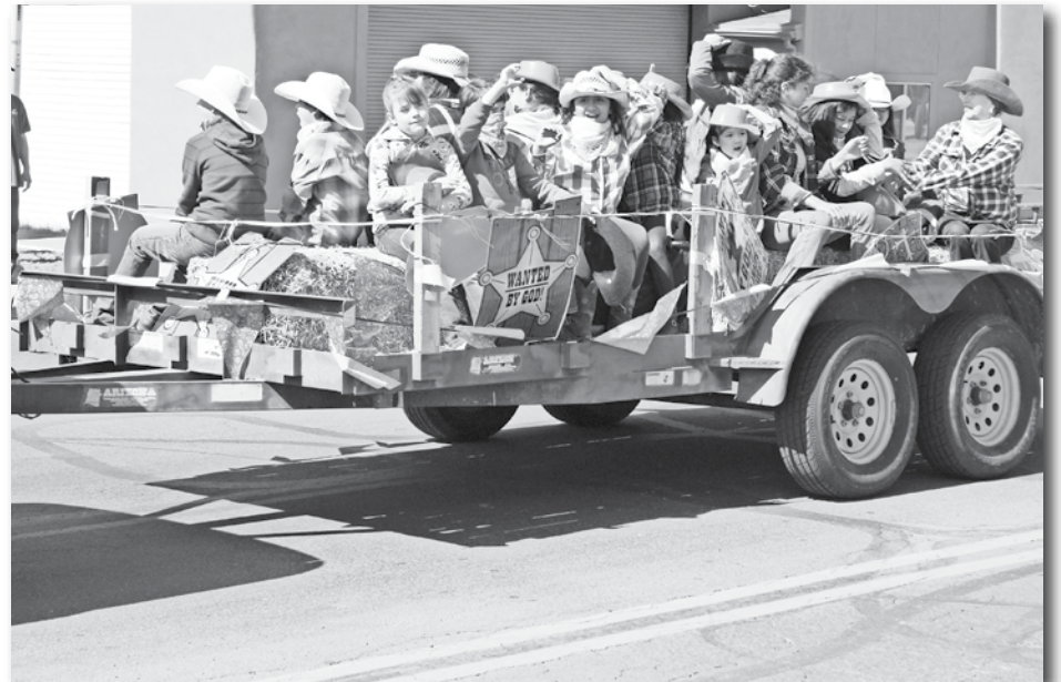
Infant Jesus of Prague Catholic Church's parade entry.