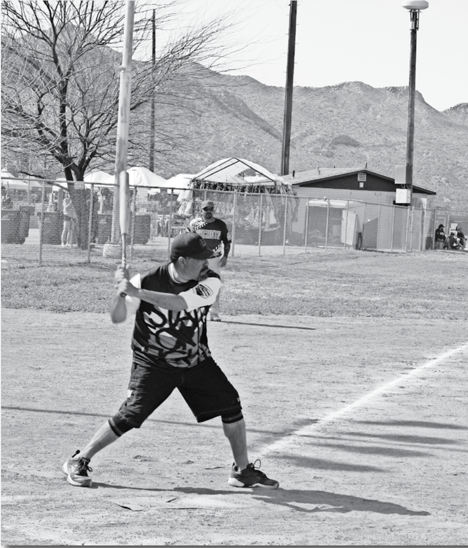
Playing in the annual Kearny Little League softball tournament.