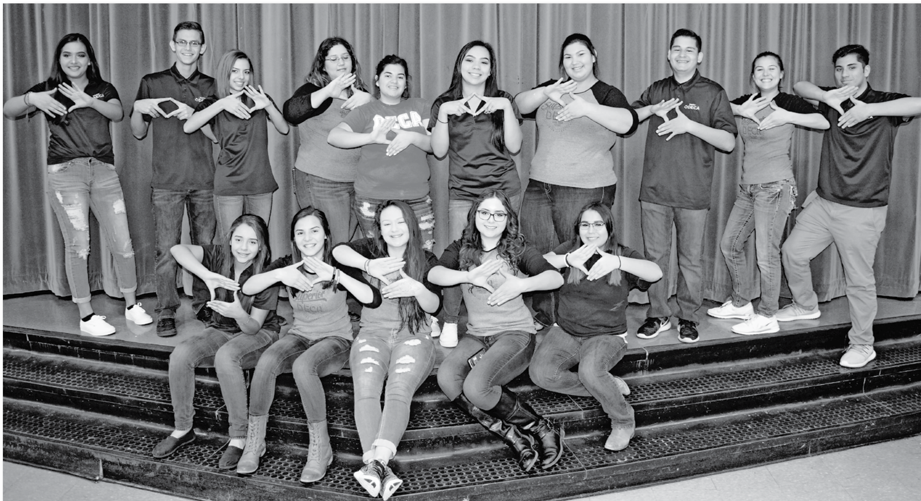
DECA students were very excited after receiving a $500 check from the Superior Rotary Club to help with the cost of attending the State Conference.