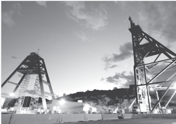
The Community Working Group will learn more about Resolution Copper's tailings plan.

More information about the CWG as well as agendas, meeting summaries, and past presentations are available for public review at the Superior Chamber of Commerce offices and at the Superior Public Library at 99 North Kellner Avenue, as well as online at SuperiorAZCWG.org/