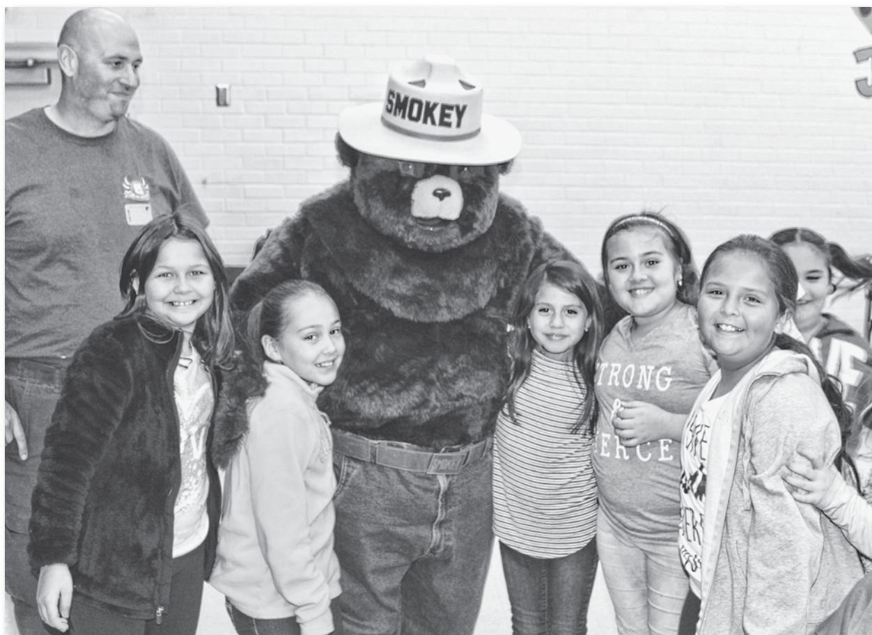
Getting a 'bear hug' from Smokey the Bear.

The musicians are all donating their services for the benefit concert. The new fund being organized by Good Shepherd is intended to meet a variety of needs of people in the Copper Basin area. The people of the congregation will be offering soups and bowls of chili free of charge. But the hat (a cowboy hat) will be passed several times during the night to give everyone a chance to support the new fund. This is a child-friendly venue.