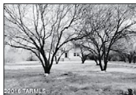
8869 S. Glenrio Rd. Dudleyville MLS#: 21631673

GORGEOUS 2400 SQ FT home on beautiful 1.33 acres covered in mature mesquite trees! It just doesn't get any nicer or affordable than this 4 bdrm, 2 bth home. Vaulted ceilings, tape and textured, new wood flooring and carpet throughout. Recently painted. Perfect for horses, chickens, ATVs and other toys. Great well for gardening and home use. Dual heating and cooling. This property has it all. OWNER-AGENT $135,000