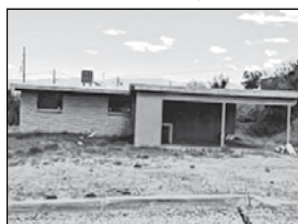
109 E. 2nd Ave, Mammoth MLS#: 21514927

GORGEOUS 2400 SQ FT home on beautiful 1.33 acres covered in mature mesquite trees! It just doesn't get any nicer or affordable than this 4 bdrm, 2 bth home. Vaulted ceilings, tape and textured, new wood flooring and carpet throughout. Recently painted. Perfect for horses, chickens, ATVs and other toys. Great well for gardening and home use. Dual heating and cooling. This property has it all. OWNER-AGENT $135,000