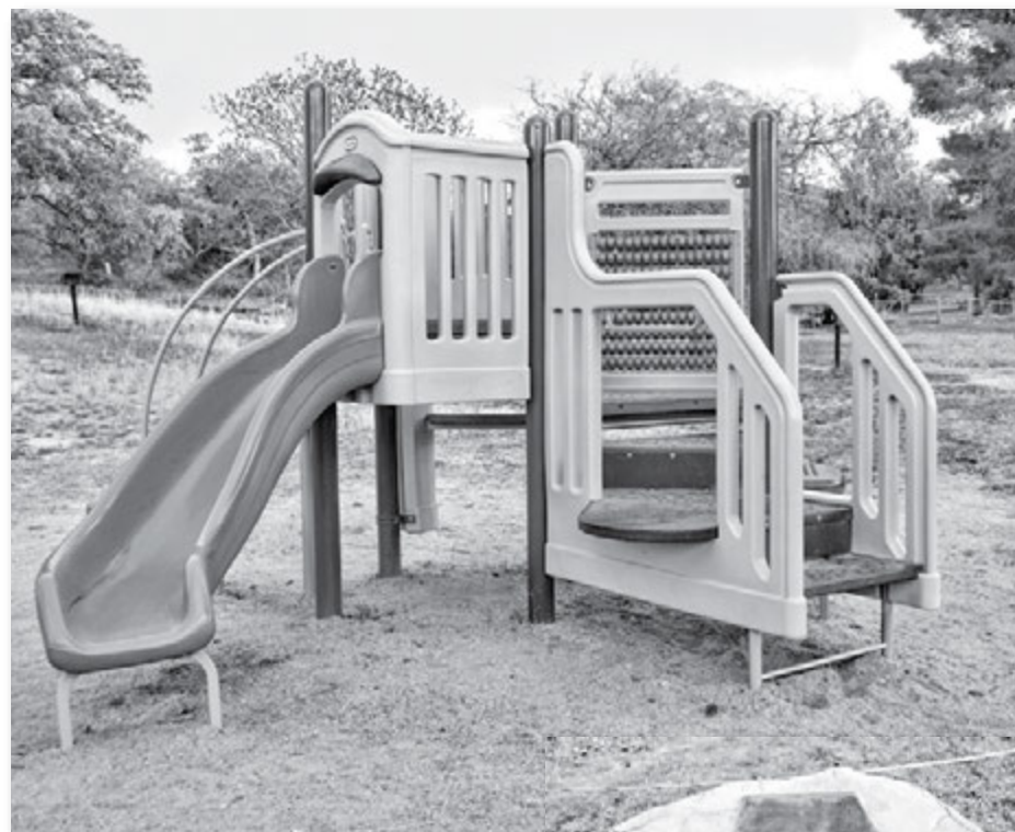
The playground at the Oracle Park on Nuestro will be receiving an update so children can play safely.