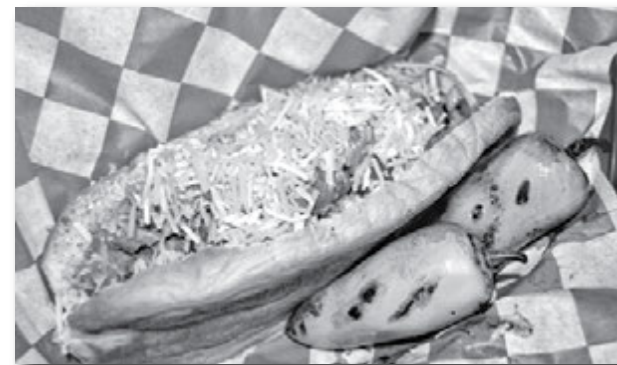
A Sonoran hot dog.