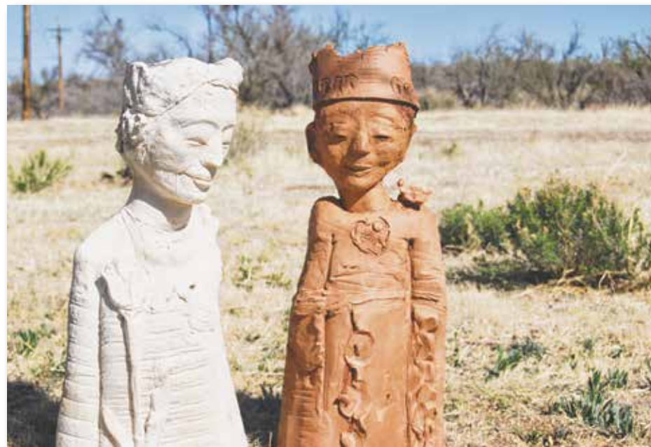
The terracotta soldiers stand sentinel at the Rancho Linda Vista's Wilson Barn property, guarding the Catalina Mountains for peace.