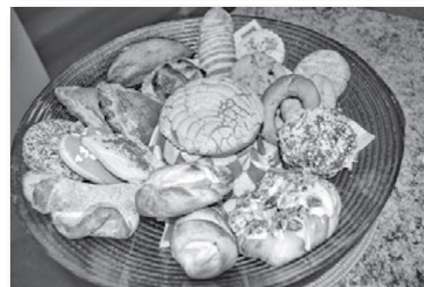
A basket of Pan Dulce looks very tasty.