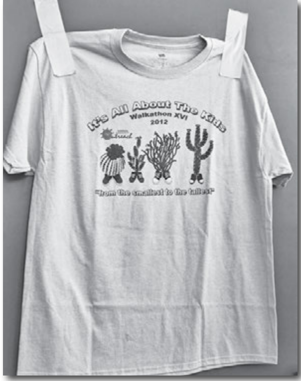
It's all about the kids.

Ford F-350 truck and sponsors the "Unit". Arizona Ophthalmologists, in private practice, volunteer their time on the "Unit" and receive no remuneration.