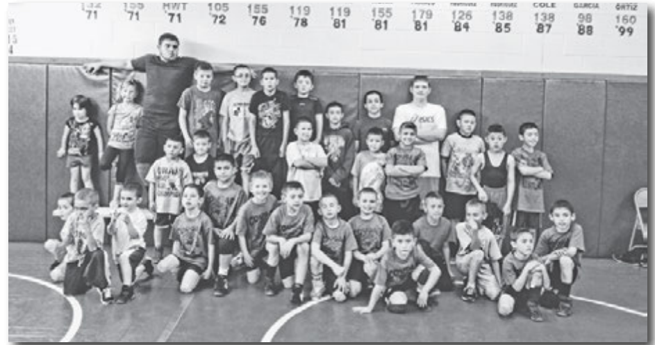
The Comets and Cougars after a fun dual.