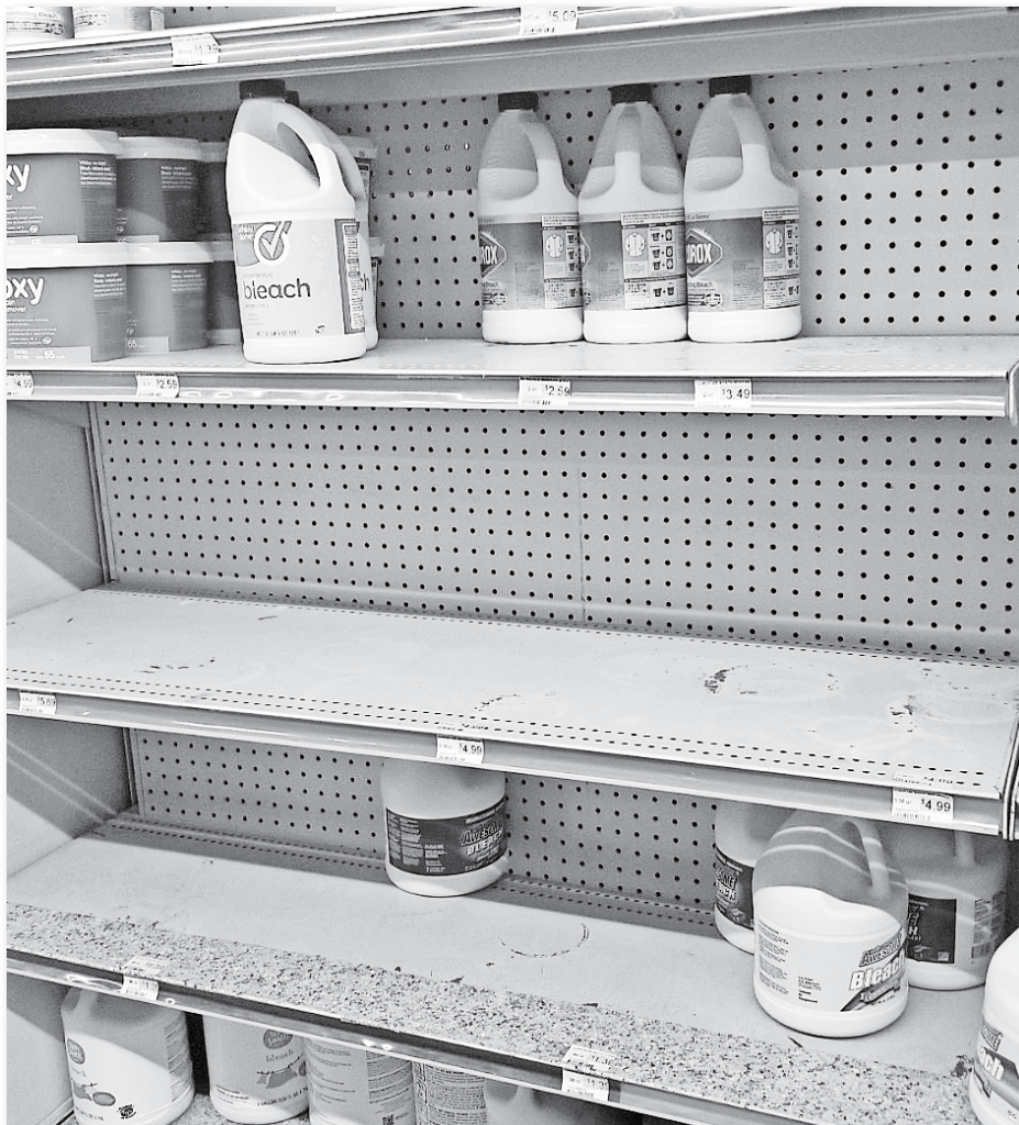
The shelves were bare at Save Money Market late last week as shoppers decended on the local store preparing for isolation.

High School students (10th - 12th) can jump start their careers by enrolling in CVIT's Central Campus Programs located on Gila Community College or Central Arizona College Aravaipa campuses. All tuition, books, and certification fees are paid for by CVIT. Students can earn college credit and industry certification while learning entry level skills.