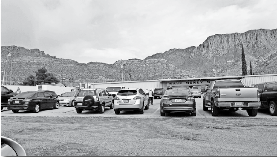
A full parking lot for Save Money Market – shoppers were stocking up in preparation for social distancing.

The Town of Superior has closed Town Hall to public access; staff is working by appointment only and all meetings are being switched to an online or phone meetings. Please call ahead to Town Hall to arrange for any meetings