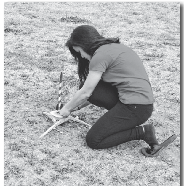
A Safety Officer readies a rocket for launch.

Also studied were lessons in "flight" and what causes flight, students learned about lift, drag, gravity, and thrust and how