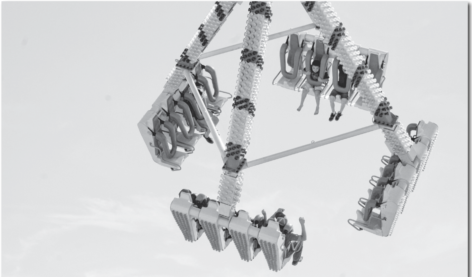
Mother Nature showed off to her most beautiful to ensure that this year's Pioneer Days was very successful. Go online to http://copperarea.com/pages/photo-gallery/ to view more photos from the weekend's activities.