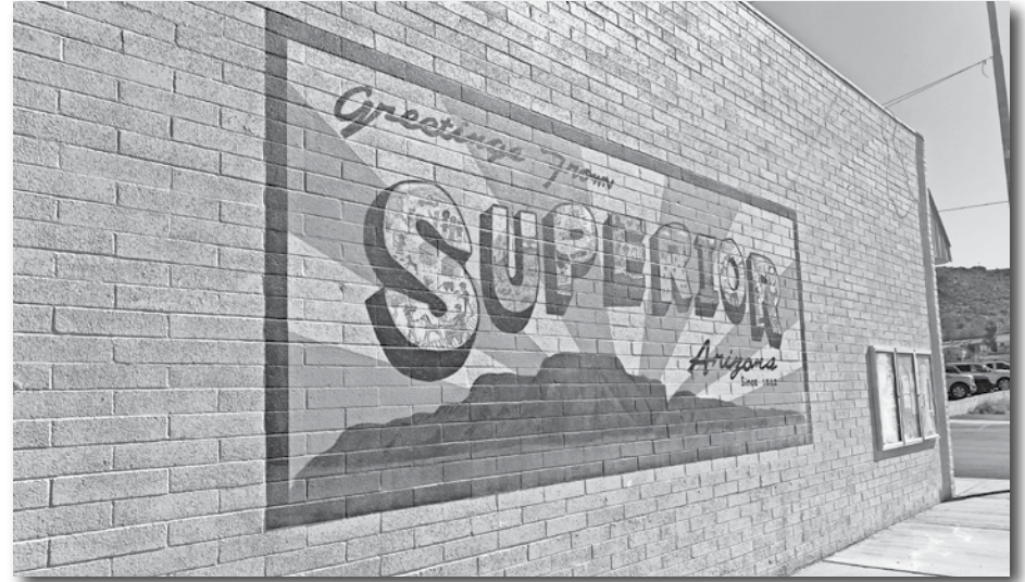
One of the many murals on Main Street in Superior.

day of exploring all that the town has to offer. For more information, contact the Superior Chamber of Commerce at 520-689-0200.