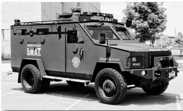
An armored Bearcat vehicle similar to the one that the Superior Police have hopes of obtaining.