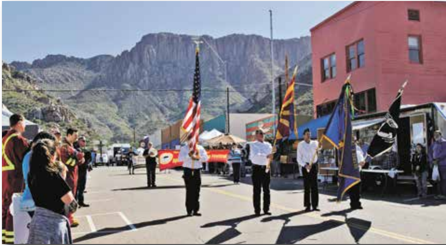
The Superior VFW leads off the parade.

Max the Chihuahua was the third time champion of the Chihuahua races. Second place went to Lilly and Lil Missy took third place in this canine competition where it was dog chase dog.