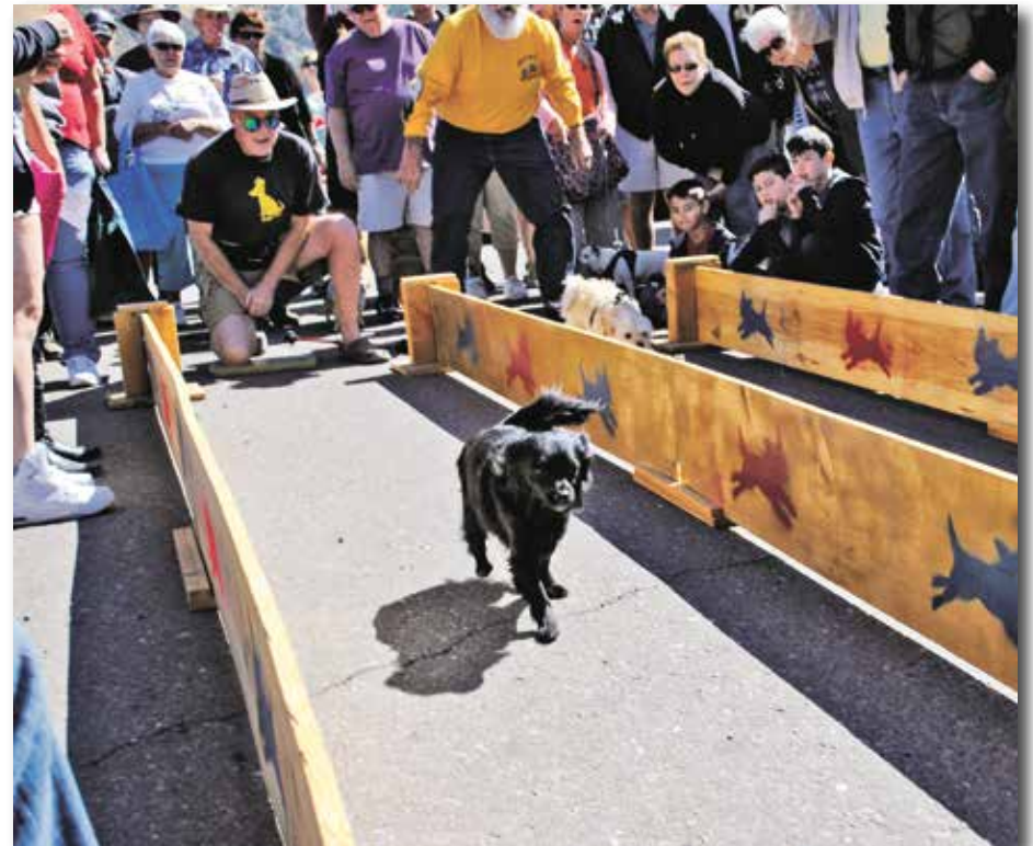
And the doggies are off ...